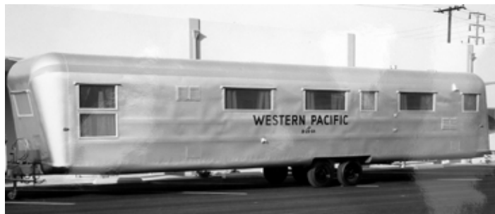
1964 40' Mobile Industrial Trailer

The Mobile Industrial trailer badges listed the same 12804 E. Firestone Blvd, Santa Fe Springs, CA address as the California Airstream plant. By 1963, the design changed to a distinctly different appearance utilizing flatter sides with a subtle ribbed appearance and fiberglass front and rear exterior endcaps that were painted silver.