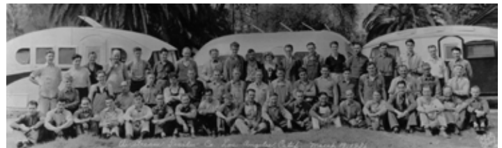
Airstream Employees and Trailers - March 19, 1936 (Silver Cloud on left, Clipper in center, unknown model on right)

It should be noted that Airstream only made a limited number of pre-WWII aluminum Airstream Clippers, each custom designed to the purchasers' requirements with a high price to match. Production of more standardized and much less expensive Masonite Airstream trailer models, including the Torpedo Junior, Airlite, and Silver Cloud, continued and represented the largest volume of Airstreams produced before WWII.