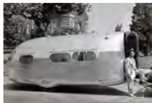
Bowlus Road Chief