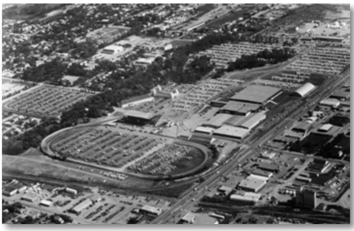
1975 International Rally - Brandon, Manitoba

The WBCCI 18<sup>th</sup> International Rally, held June 25 – July 4, 1975 at the Keystone Centre in Brandon, was a popular one, the largest one to that date and the 2<sup>nd</sup> largest ever with 4209 Airstreams and about 12,000 persons attending. The rally fee was only $35 (in U.S. dollars) for an Airstream and two adults. It was reported that about 3000 trailers arrived on the first day of parking and the lineup of Airstreams waiting to enter the rally site stretched for over 4 miles!