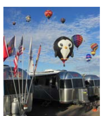
Balloon Fiesta National Rally

By the current definitions, these two types of rallies are hosted by WBCCI Units or Regions but are open to all club members. They