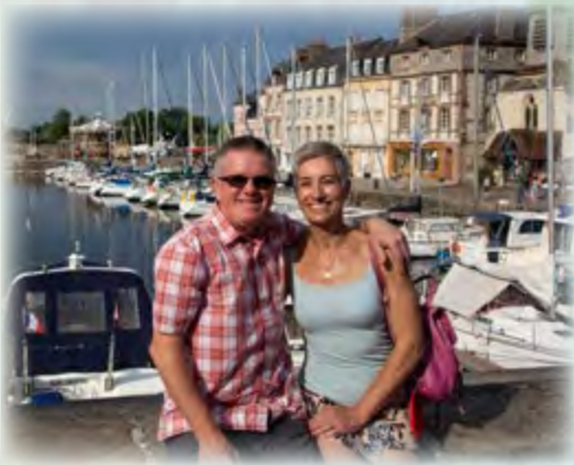
Just to prove I was on the trip!