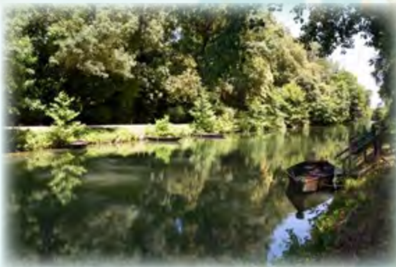
La Venise Verte