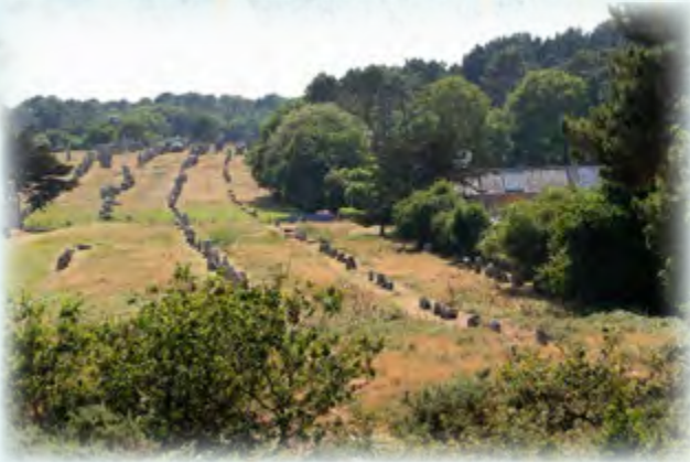
Some of the Carnac Stones laid out over a 4km distance