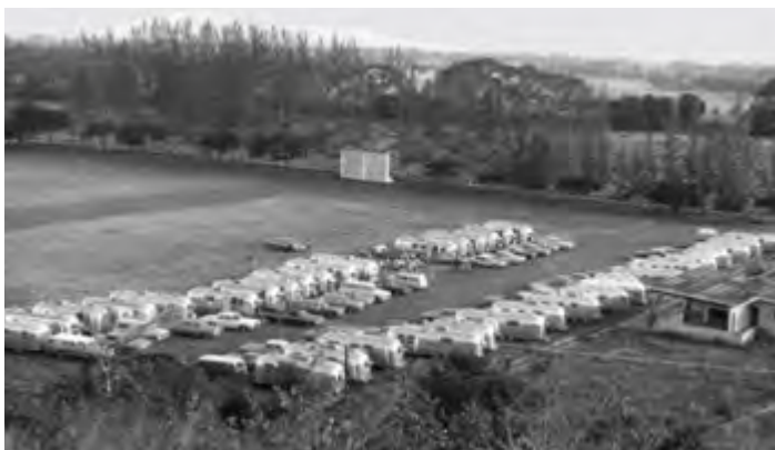
Camp at Spanish Town

Though the streets were often crowded with people, cars, and wandering animals, the caravanners were amazed by the friendliness and courtesy of all the people they met.