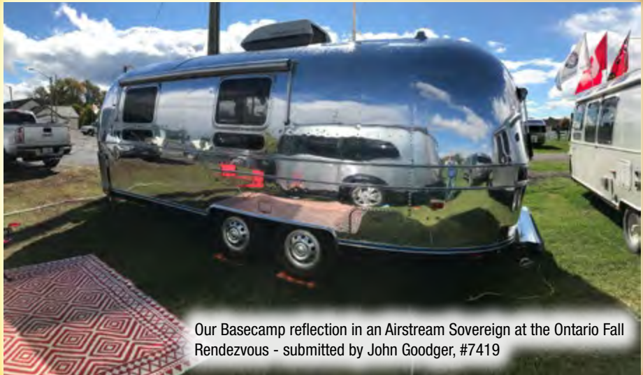
Our Basecamp reflection in an Airstream Sovereign at the Ontario Fall Rendezvous - submitted by John Goodger, #7419