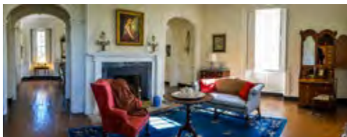
Berkeley Plantation Interior

We've said it before, but it's worth repeating: Virginia is all about American history! Nowhere is this fact more evident than along the James River and on Virginia's "peninsula." Visiting them properly and thoroughly takes time. So, while seeing the James River Plantations can be done as a long "day trip," enjoying "America's Historic Triangle" takes much longer. This article should help you plan accordingly.