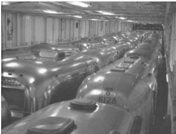
Airstreams Loading and Aboard the MS Starward

Once unloading was complete, the caravanners received a police escort to the experimental farm of the Jamaica College of Agriculture in