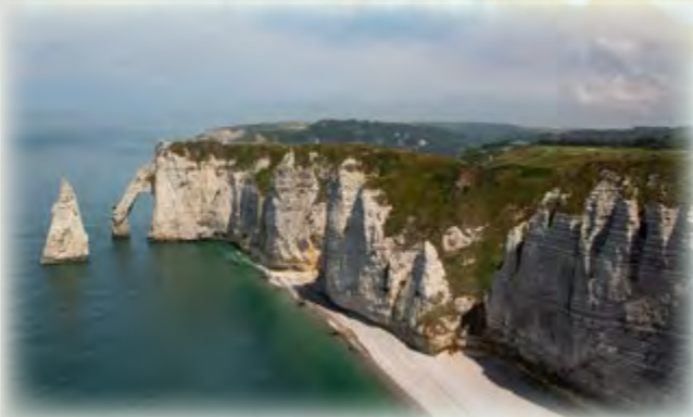
Etretat - with the arch that resembles an elephant coming out of the cliff

One of the most amazing things we saw in Brittany was only a short drive from the campsite. About 5,000 years ago, about the