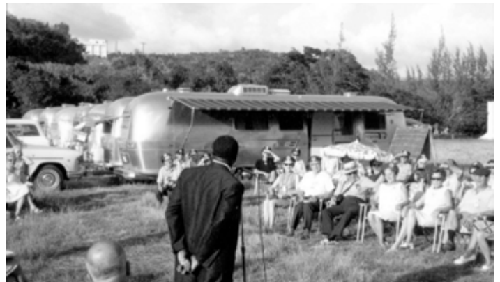
Mayor of Spanish Town Addresses Caravanners