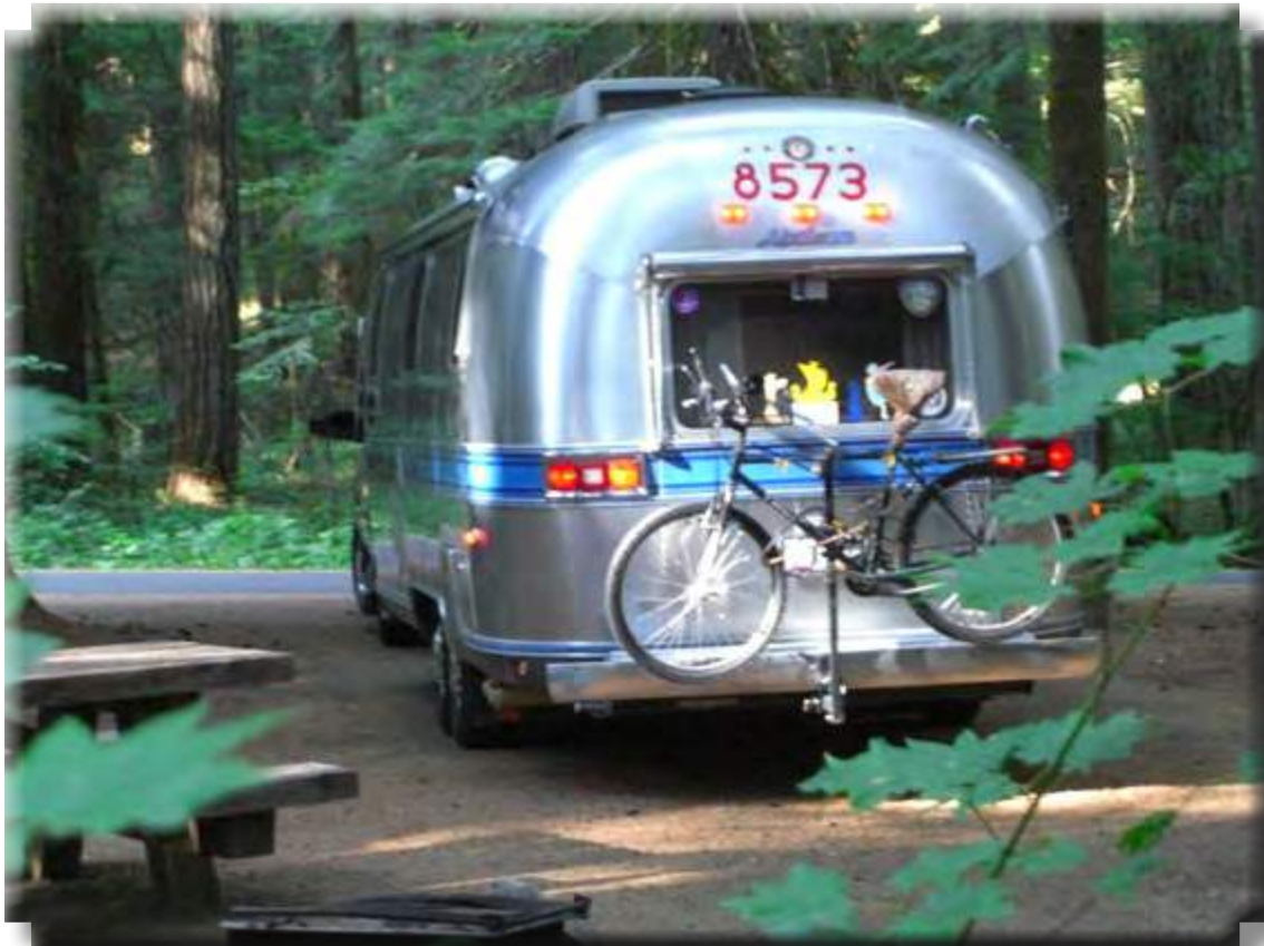
Our 1987 25' trailer parked at a forest service campsite in central Washington - submitted by Dan Oborn, #8573