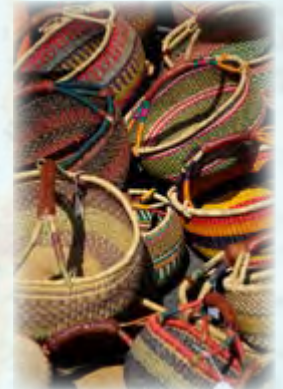
The market was full of colour

We woke on the first morning to sunshine and the sound of birds in the trees... oh yes, and my excellent BBQ, which was cooking up bacon and sausages...mmmmm! Being on the edge of the river gave us an excellent opportunity to walk off the indulgent breakfasts and ice cream. It is a very tranquil part of Brittany.