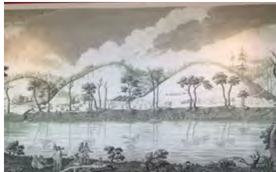
Artist's rendition of the three hills where cannons were placed overlooking the Hudson River