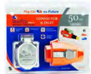
50 Amp Inlet and Connector Kit