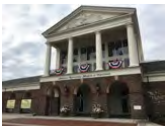
American Revolution Museum

At the northern end of the Colonial Parkway lies the third point of the Historic Triangle: Yorktown. This charming community on the south bank of the York River is where General Washington and his Army, along with French allies led by a young Marquis de Lafayette, defeated English General Earl Cornwallis. Their victory hastened the end of the American Revolution and the birth of the U.S. On the southeast side of the town is the National Park Visitor Center. It has exhibits, a film, and offers ranger-