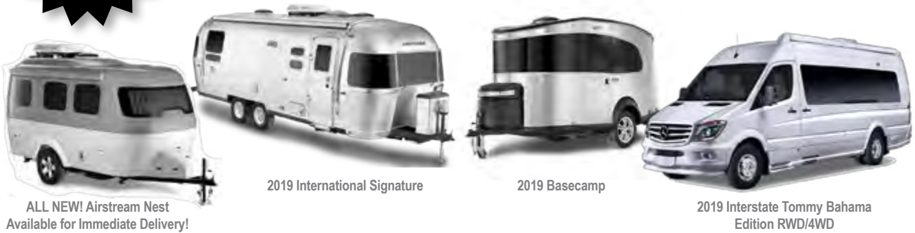
ALL NEW! Airstream Nest Available for Immediate Delivery!