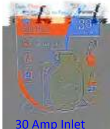
30 Amp Inlet

Airstream Factory Service Center 419 West Pike Street Jackson Center, OH 45334 (937)-596-5111 ext. 7403