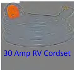
30 Amp RV Cordset