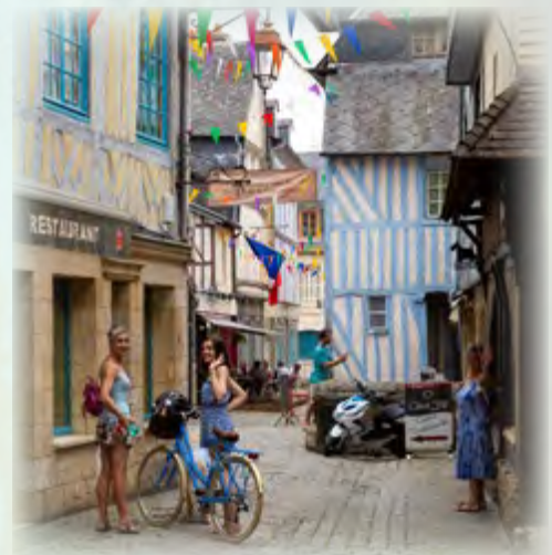
Centre of Pont Audemer