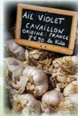
How French can you get...

After 4 hours cruising from Normandy we reached Pont Aujan in the Morbihan region of South Brittany. We stayed at Camping Pont Aujan, a beautiful spacious site on the River Le Blavet. The campsite was empty and the pitches were one of the best on the whole trip.