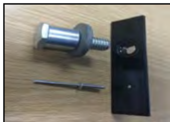
Striker Backing Plate

Next you will want to close the door slowly to see how the jaws on the latch line up with the striker bolt. Pictures below.