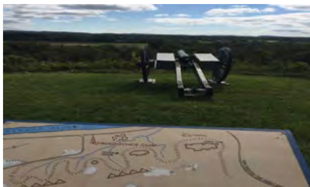
Battery protecting British hospital/stores from a possible attack from the Hudson River