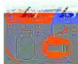
30 Amp Inlet and Connector Kit

Airstream Factory Service Center 419 West Pike Street Jackson Center, OH 45334 (937)-596-5111 ext. 7403