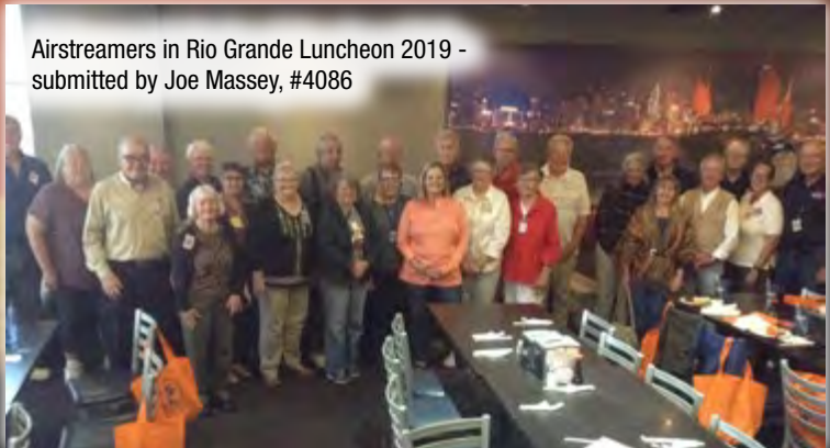
Airstreamers in Rio Grande Luncheon 2019 - submitted by Joe Massey, #4086