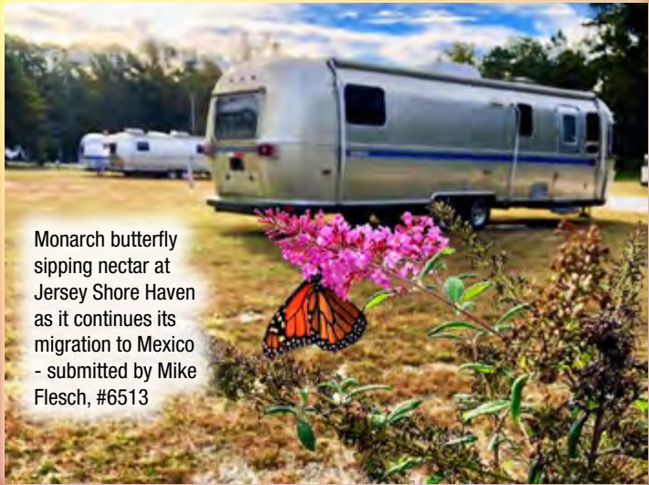
Monarch butterfly sipping nectar at Jersey Shore Haven as it continues its migration to Mexico - submitted by Mike Flesch, #6513