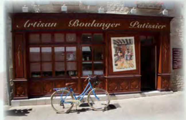
Our local Boulangerie

same time as Stonehenge was thought to have been erected by the Druids in England, another similar civilisation laid out the Carnac Stones. There are over 3,000 stones mostly in lines over a 4 km spread. It is worth an afternoon visit in anyone's trip.