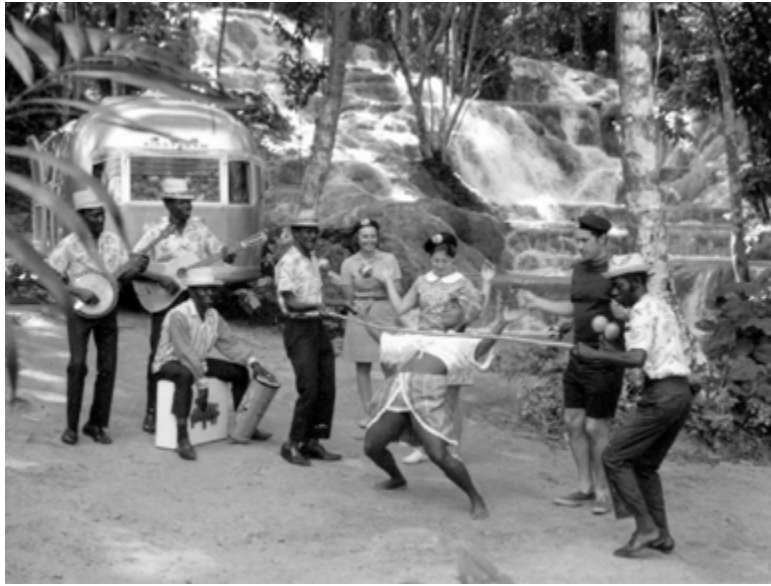
Limbo Demonstration at Dunn's River Falls near Ocho Rios

The next travel day, heading west along the shoreline and then north across the peninsula, each small village brought masses of smiling, waving locals who were prepared in advance for the passing of the line of silver Airstreams. In Lucea, they were camped a stone's throw from