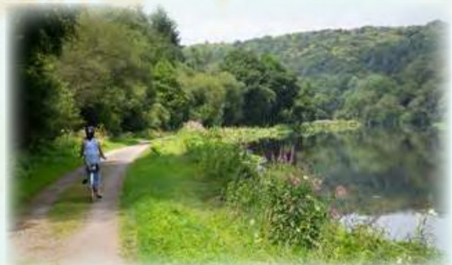
River Le Blavet