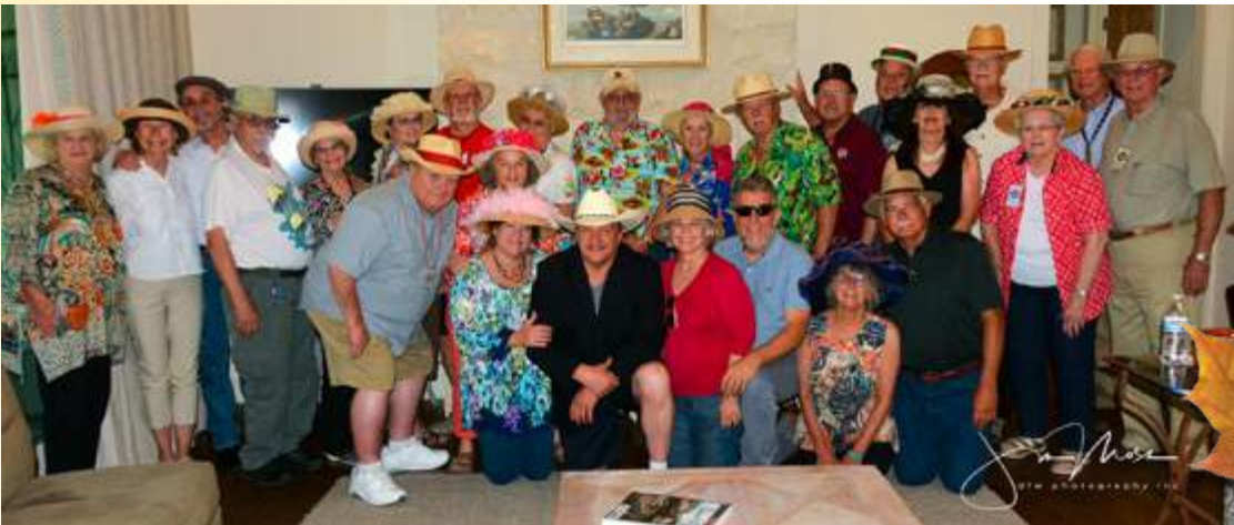
Texas Highland Lakes Unit Kentucky Derby Party - photo by Jim Moss/dfw photography, submitted by Debbie Trimble, #4842