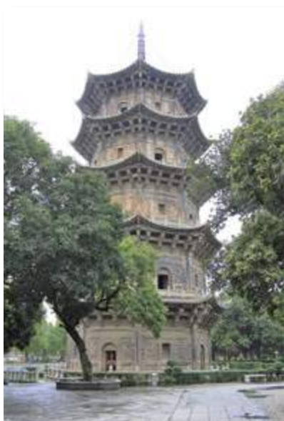
700 Year-Old East Pagoda

Today we visited an eel farm that sells eels to Japan and Hong Kong. We also visited the lovely Chinese mansion of a Chinaman who owns a tailoring business in Singapore. Then back to the trailers for lunch. It is cool in the mornings and evenings, but the days are hot. The local kids are beginning to get on our nerves, peeking in windows, pressing on our screen door, and ringing the doorbell. We have to close the door and pull in the windows, otherwise the screens get broken.