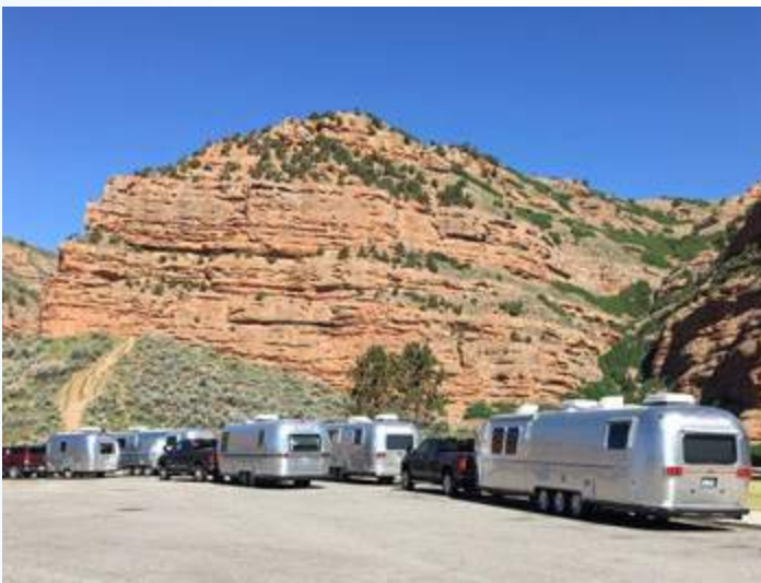
On the way to Salem - photo by Linda Poage, #7073, submitted by Pat Shaw, #6318