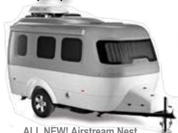
ALL NEW! Airstream Nest Available for Immediate Delivery!