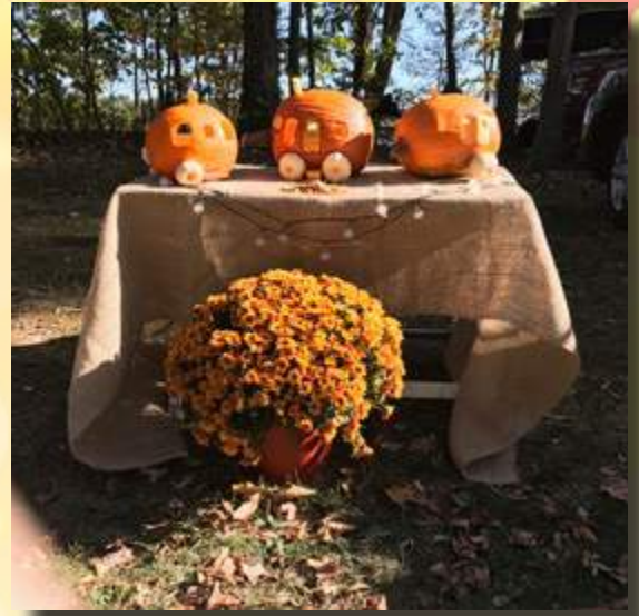
Pumpkin caravan of Airstreams - submitted by Ella Brown, #4048