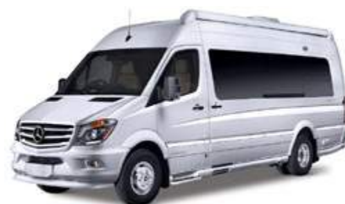
2018 Interstate Tommy Bahama Edition RWD/4WD