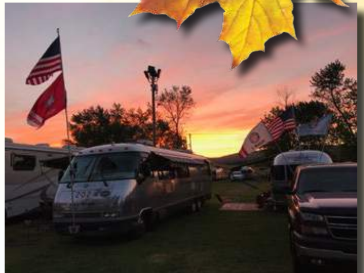
Sunset at the Region 2 Rally, New Paltz, NY - submitted by Pat McFadden, #202