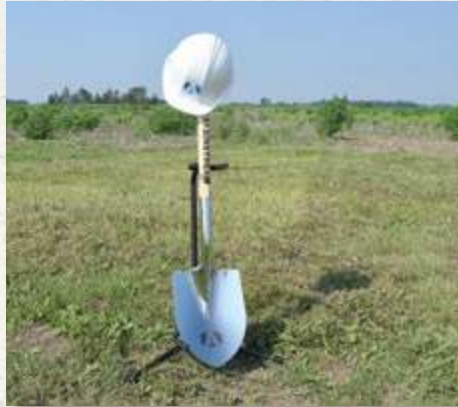
Groundbreaking ceremony August 3, 2018

Now, sixty-six years later, Airstream is once again making history in Ohio as the company begins construction on the most significant plant expansion in its history. The groundbreaking