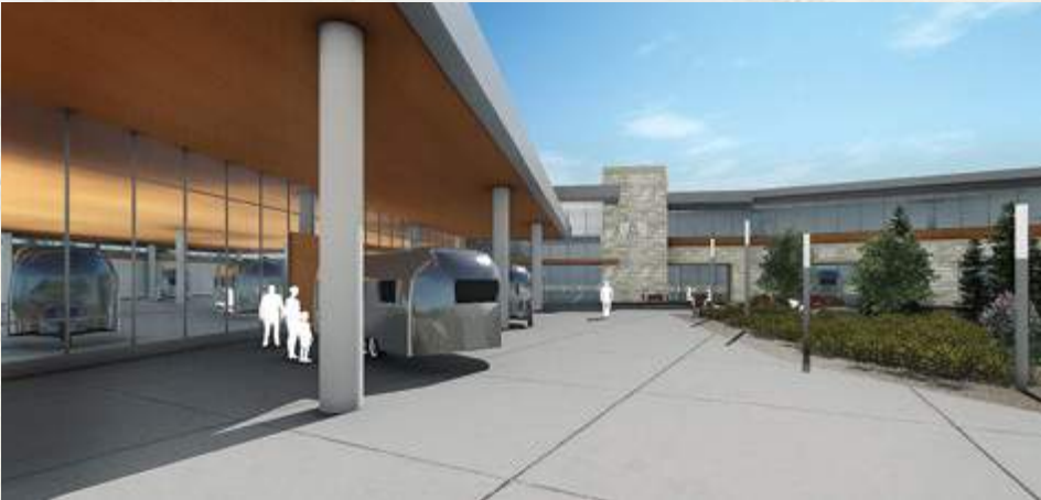
Conceptual drawing of the Airstream Heritage Center

Airstream's motorized touring coaches, freeing up production space to support a growing line of products that appeal to a broad spectrum of RV enthusiasts including Basecamp and Nest.