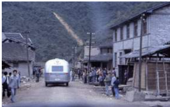
A View from the Caboose