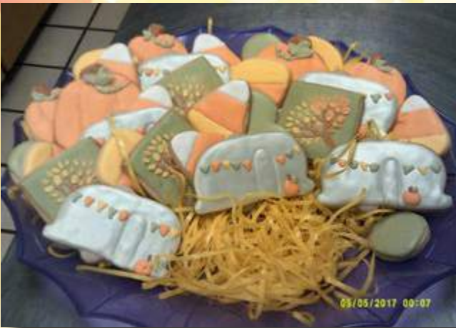
Fall cookies at Fall Rally