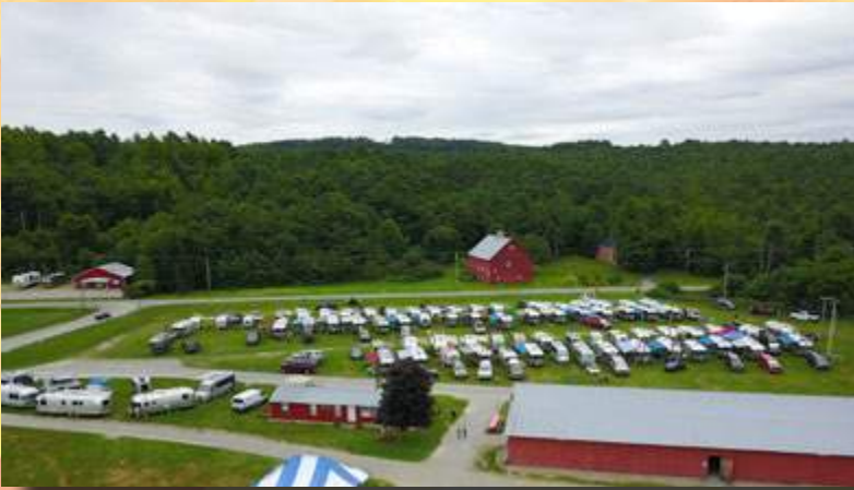
Region 1 Rally with over 80 Airstreams at Haverhill, NH - photo by Doug Hart, #1837, submitted by Rick Cipot, #3411