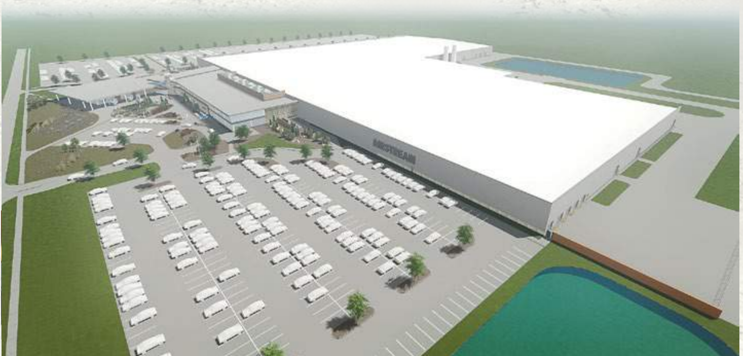
Conceptual drawing of Airstream's plant expansion

The current 255,000 square-foot travel trailer plant will be converted to allow for production of