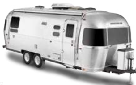
2018 International Signature