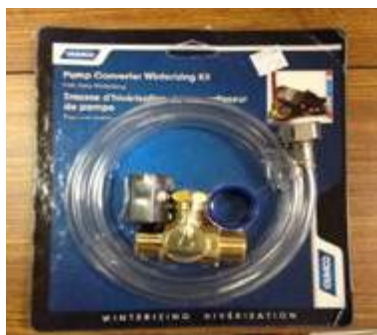
Airstream Part Number 100363W

I am attaching a picture of the Pump Converter Winterizing Kit (T-Kit) to winterize the lines with antifreeze and a picture of the blow out plug needed for winterizing with compressed air.