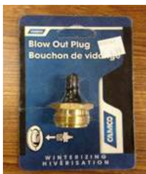
Airstream Part Number 90214W