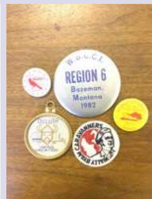
Artifacts in the AICA collection