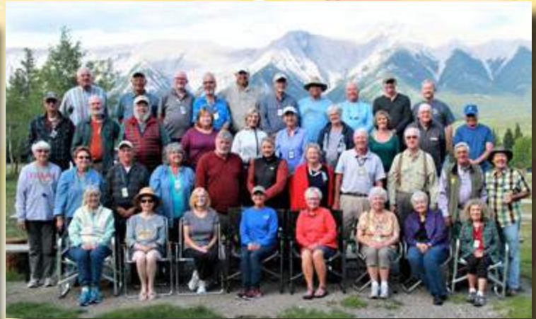
2017 Canadian Rockies Caravan - submitted by Terry Esrael, #6640