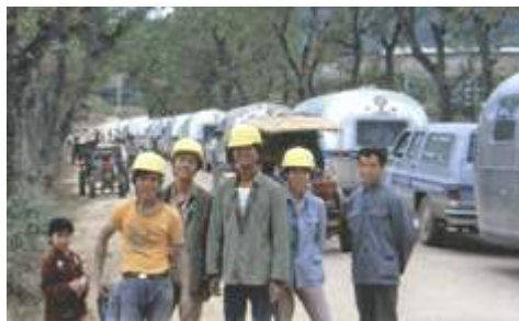
Workers along a Chinese Road

2 hours to drive 41 miles today. The road to Xiamen was not too busy, but we had fast