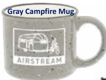
Gray Campfire Mug