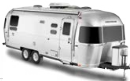
2018 International Signature