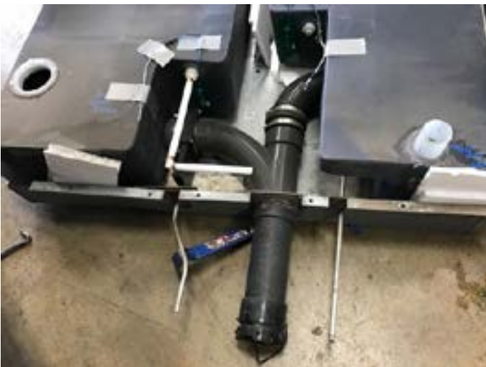
Typical Tank and Dump Valve Assembly Layout