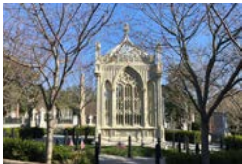
Monroe's Grave, Hollywood Cemetery

In next month's Blue Beret: What to see and do driving westward from The Meadow Event Park.