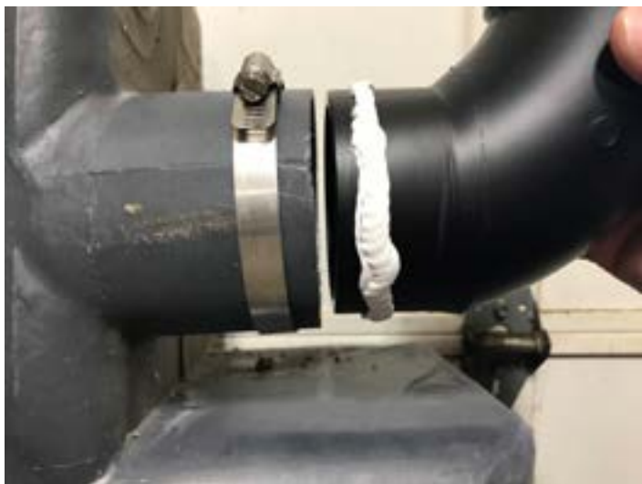
Sealant Applied to Fitting

Now it is time to make a patch to cover the access hole we cut in the tank pan at the beginning. I use sheet aluminum and make the patch one inch larger all the way around so I have plenty of room to fasten it in place. Pictured below. Use 3/8 inch sheet metal screws to fasten the patch to the tank pan.