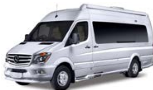
2018 Interstate Tommy Bahama Edition RWD/4WD