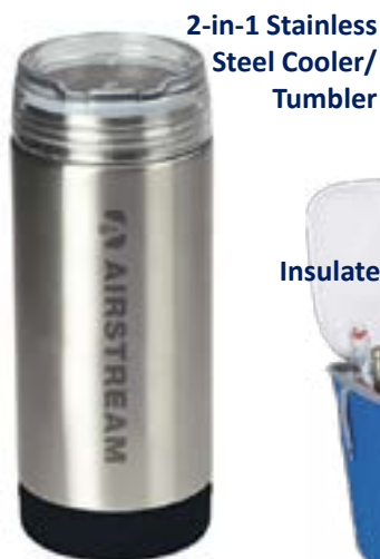
2-in-1 Stainless Steel Cooler/ Tumbler

Check out the new items available on our online store!! Please visit www.airstream.com to place your order.