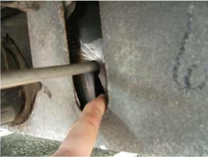
Shine a flashlight in this area to see the dump valve plumbing