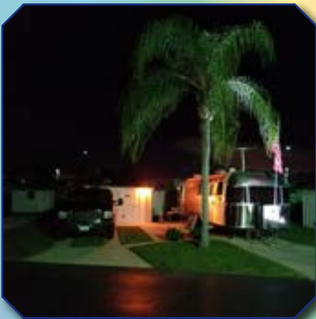
A peaceful night at Airstream Land Yacht Harbor, Melbourne, FL