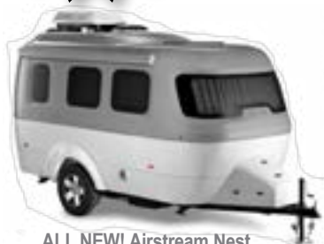
ALL NEW! Airstream Nest Available for Immediate Delivery!