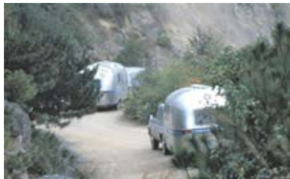
Mountain Road in China

Today we drove to a small village where we walked thru rice paddies to