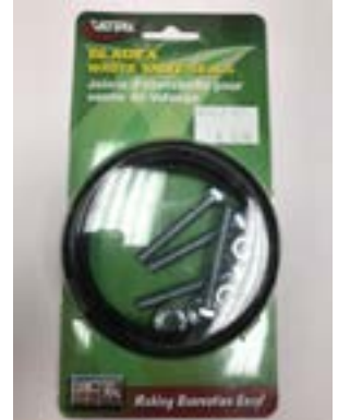
Valterra Repair Package 601607-101

Once you have the screws removed, the valve will come apart into two sections. You will need to remove all gaskets and clean thoroughly. Usually warm soapy water will work fine for cleaning.