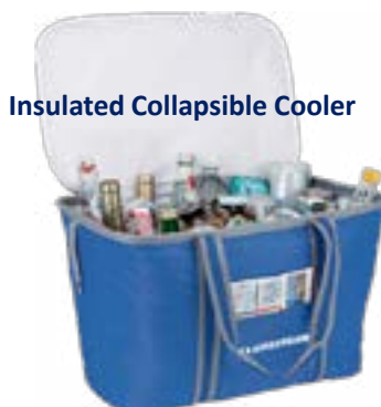
Insulated Collapsible Cooler