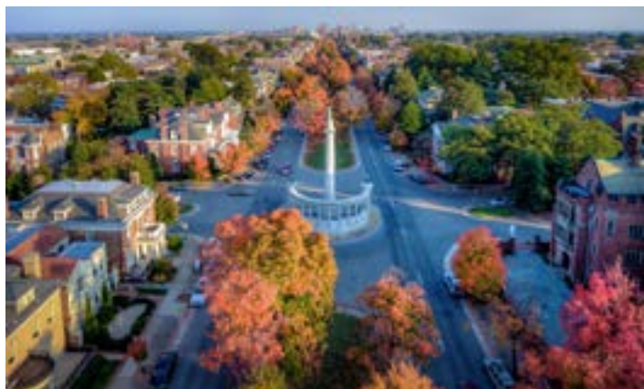
Monument Avenue, Richmond, VA

$ While in Richmond, tour the glorious state Capitol Building (designed by Thomas Jefferson), see the “White House of the Confederacy” and Civil War Museum, take a walk in beautiful Hollywood Cemetery (an arboretum where two U.S. presidents are buried) then drive down the famous Monument Avenue, to see its beautiful homes and several plazas featuring majestic monuments to Confederate war heroes (as well as an imposing statue of hometown tennis great, Arthur Ashe). Richmond also features a noteworthy Museum of Fine Arts and the Virginia Science Museum. The affluent suburb of “Short Pump,” 16 miles northwest of downtown, has a collection of great stores and restaurants for shopping and fine dining.