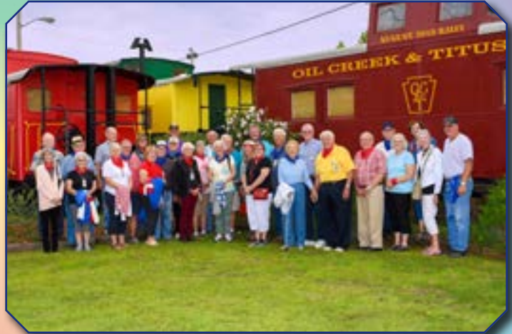
Akron Ohio Unit on a Murder Mystery Train Ride in Titusville, PA - submitted by Betsy Ketchum, #1650