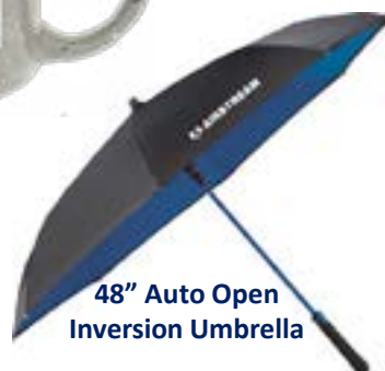
48" Auto Open Inversion Umbrella