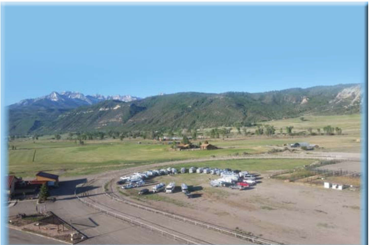
Ridgway Circle the Wagons Rally, Denver Colorado Unit - submitted by Carolyn Beardshear, #7982