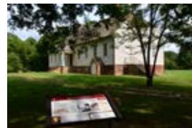
Patrick Henry's Scotchtown

$ Do a "Patrick Henry Tour" - Get to know one of Virginia's most beloved patriots. See nearby "Scotchtown" (his home from 1771-1778), have lunch at his father-in-law's Hanover Tavern, then drive 26 miles into Richmond to visit St. John's Church, site of Henry's famous "Give me Liberty or Give me Death" speech (March 1775) encouraging the American Revolution.