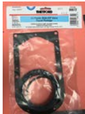
Thetford Repair Package 009872