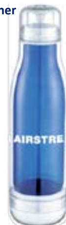
17oz Sport Bottle with Glass Liner