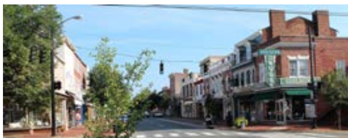
Downtown Fredericksburg, VA