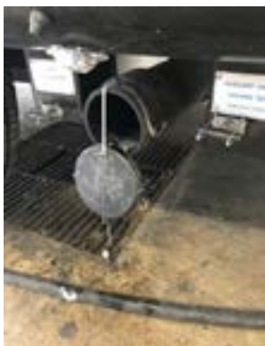
Leaking Dump Valve Assembly

The black and grey tank dump valves are blade style valves that require you to pull a handle to open the blade assembly and dump the specific tank. When closed the blade presses in to a rubber gasket sealing the contents in the tank. We hear from time to time from customers that when in the closed position and removing the seal cap, they always get a small puddle of liquid that spills out. In most cases the reason for this is that solids, debris, or toilet paper did not get completely cleaned out during the dump process. Then when they close the blade valve the debris gets forced into the gasket not allowing it to completely seal. This is why it is recommended to use your black tank flush every time you dump your tanks if your trailer is equipped.