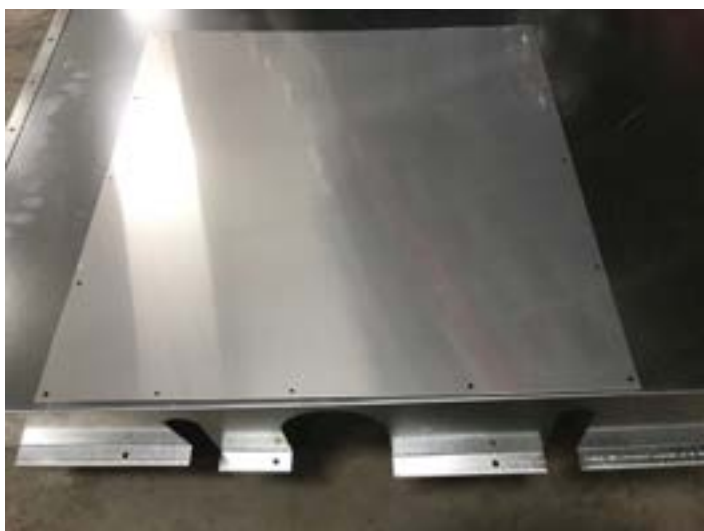
Bottom View of Tank Pan with Patch

Now it is time to make a patch to cover the access hole we cut in the tank pan at the beginning. I use sheet aluminum and make the patch one inch larger all the way around so I have plenty of room to fasten it in place. Pictured below. Use 3/8 inch sheet metal screws to fasten the patch to the tank pan.