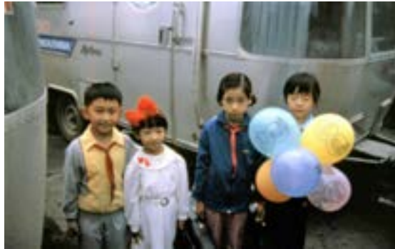
The Children that visited the Roeser’s Trailer

Back to the hotel for our banquet. The Banyan City Restaurant was almost dark when we arrived, a consequence of power rationing, but three Coleman lanterns lit our way. A bit of information: All Chinese banquets are 12 courses. The last one is something sweet – a sweet soup.