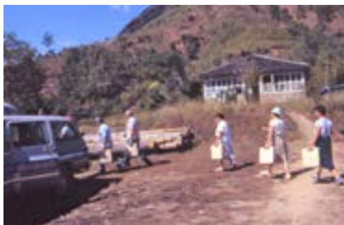
Porta Potti Parade

were underway floating down the Nine Twist Stream sitting in bamboo armchairs on bamboo rafts. Two men used poles to direct the rafts downstream.