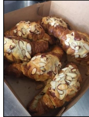
Almond Croissant at Ryus