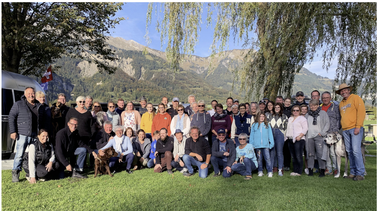
This summer: European Club members at a rally by Lake Brienz, Switzerland

The European Airstream Club continues to do well with good participation and many interesting rallies. A good sign for its future is that lasting friendships are starting to form between members. Committee member Ian Jamieson mused that he now has friends in many different countries thanks to the club. Many others in the European Club feel the same way. In this day and age, building international bridges feels like a good thing! The fact that these friendships involve Airstreams is just wonderful.