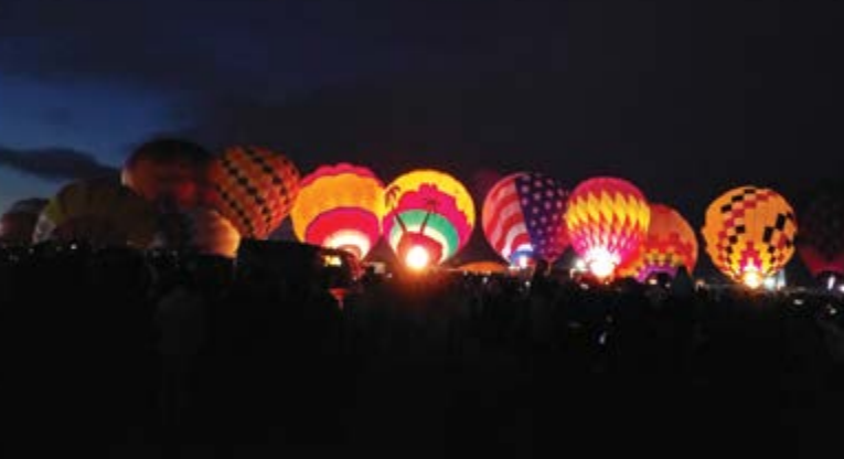
Dawn Patrol at Balloon Fiesta Rally