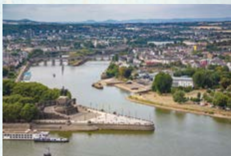
The confluence of the Rhein and Mosel Rivers

The following day we started with a visit to Ehrenbreitstein Fortress which stands 118m above the Rhein overlooking Koblenz and has a history going back 1000s of years due to its strategic position. It has been occupied and reoccupied numerous times including once again being blown up by the French!