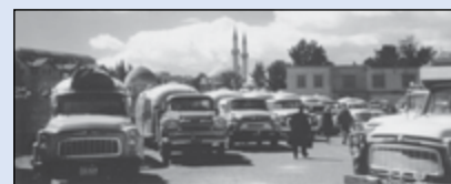
Camped in Downtown Damascus, Syria