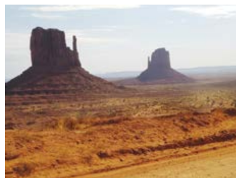
Monument Valley Mittens

Valley gave us a view of rock formations that served as the backdrop to many western movies. On the drive to Monument Valley, we saw a famous movie backdrop. Can you say, "Run Forest Run?" When presented with a chance to see the Four Corners Monument on our next travel day, we had to stop.