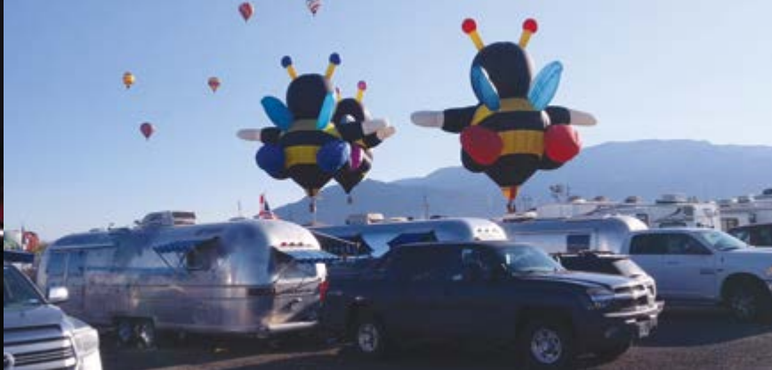
Balloon Fiesta Rally

the rest of the caravan. It was good to see her.