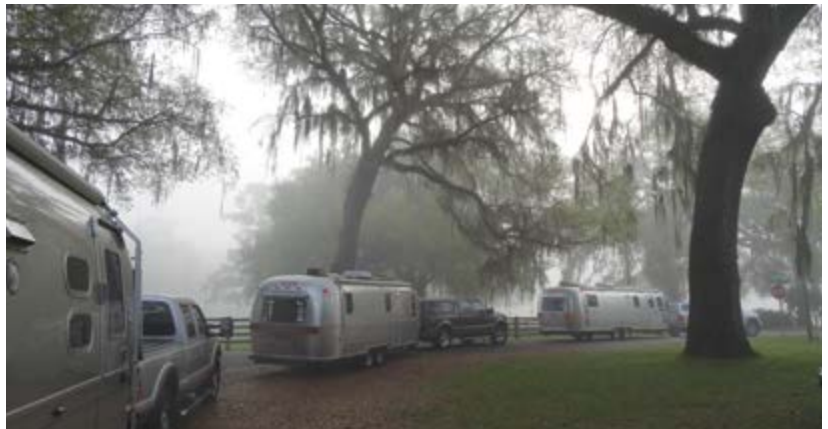
Leaving Bradley's Country Store, Georgia Plantations and More