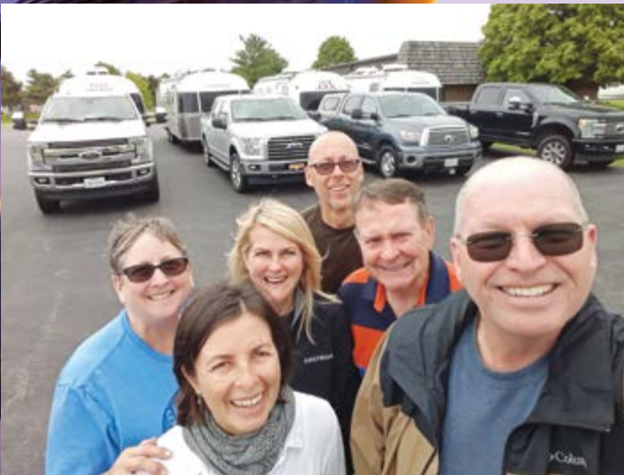
Club members visiting Headquarters on the way to Alumapalooza