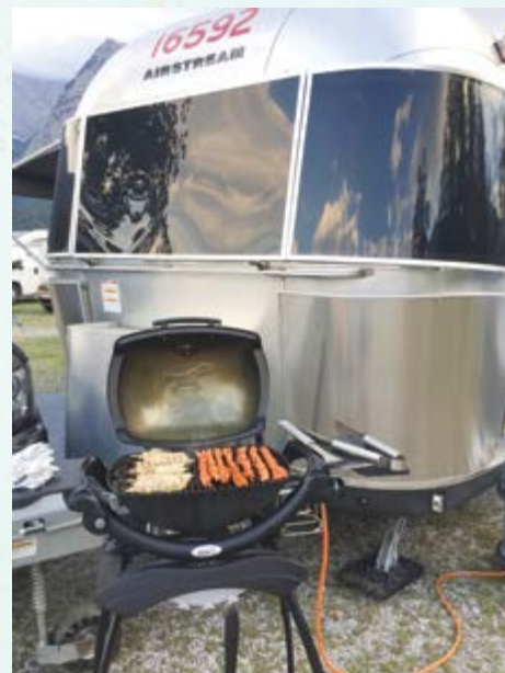
Always time for a BBQ