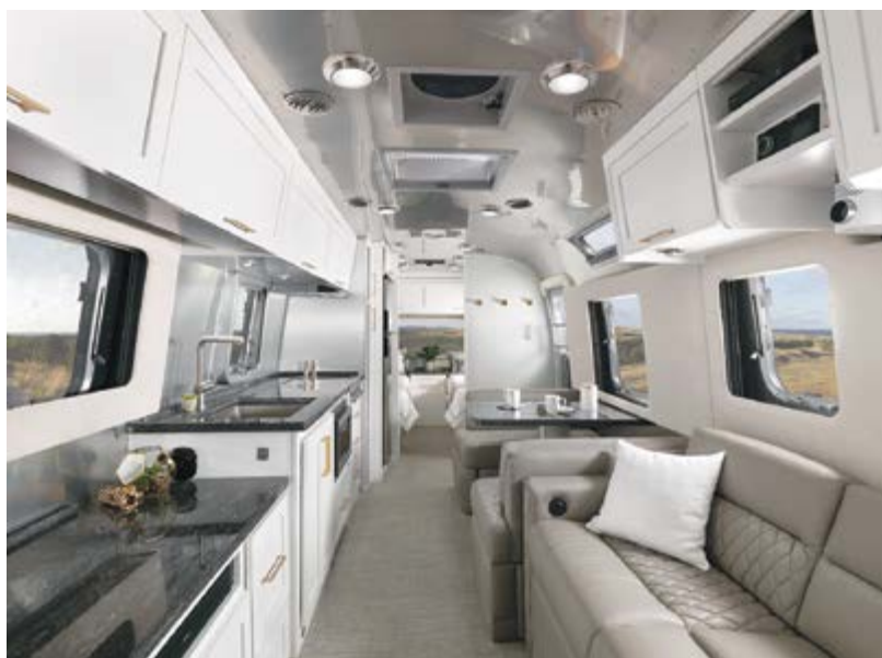
2020 Classic Interior Comfort White Earl Grey Ultraleather