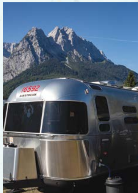
Ali - all set up under the Bavarian Alps

here to minimise traffic - if you are a visitor staying at a local campsite, or I assume a local hotel, you get a free bus pass to use the local bus that runs on a regular basis between the main sites. You can even use the pass further afield throughout the whole Garmisch-Partenkirchen District. And yes I did say 'free' for the length of our stay. So we used it to get to town and typically - as we are in Germany - it all worked perfectly.