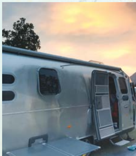
Sunset on our first night in Bavaria

We woke up to a nice pleasant sunny day and we headed into Garmisch-Partenkirchen, the main town nearby. They have a great system