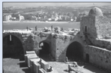
Exploring the Sea Castle at Sidon, Lebanon