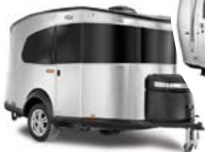
All New! Basecamp