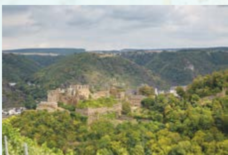
Schloss Rheinfels with the Rhein just on the other side of the castle

We went on to Schloss Rheinfels at St. Goar. This was a proper castle that has seen a lot of action over the years. It is a medieval castle that has now partly been converted into a hotel. The castle was built in 1245 to protect the St. Goar tax collectors and was expanded over the centuries to become one of the leading castles in the Rhein Valley and one of the strongest fortresses in Germany...well that was until the French blew it up during the French Revolution in 1797!! The visit made me realise how in medieval times if you owned land and were lucky enough that a major trading route went through it (The Rhein), then you had an enormous opportunity to extort taxes from people who had to use that route - a license to print money!...nothing has changed then!! The great hall has been renovated and has amazing echos and acoustics!! Abigail sang for us in the hall – fantastic.