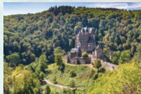
Eltz Castle - Hidden away in the forest above the Mosel

The Mosel is stunning - I think even more stunning than the Rhein. It has so many loops and curves that, combined with all the vineyards that climb the slopes on either side, every corner you turn is stunning. It's also so easy to miss things - we met an emergency services roadblock and had to take a detour to find another route. We turned around and took a road that went up a hillside in the hope of finding another road that would rejoin the Mosel further on - instead we found Eltz Castle...what a great find!