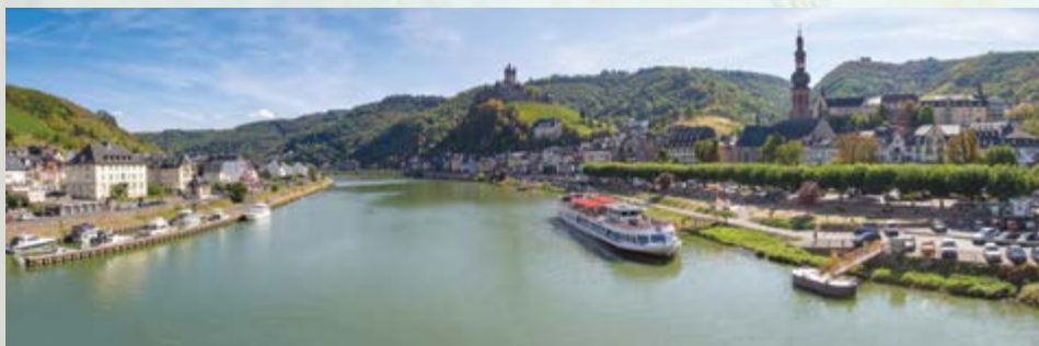
The River Mosel at Cochem