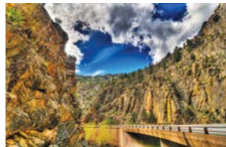
Big Thompson Canyon

US Highway 34 passes through Loveland, enters the towering granite walls of the Big Thompson Canyon, continues to follow the Big Thompson River to the town of Estes Park and the entrances to Rocky Mountain National Park (RMNP). In RMNP