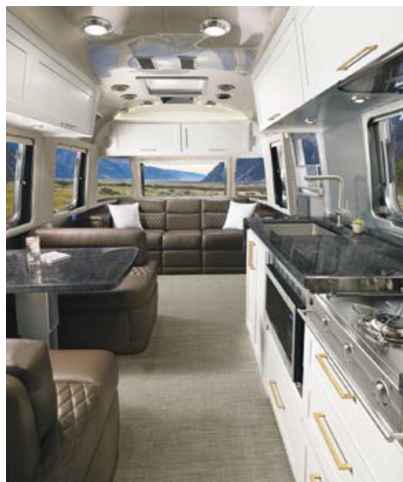
2020 Classic Interior Comfort White Café Latte Ultraleather