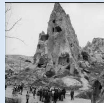
Caravanners Tour the Cappadocia Ruins at Göreme, Turkey