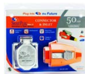
50 Amp Inlet and Connector Kit