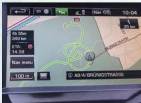
An interesting route out of Switzerland

On arrival our first impressions of the campsite are quite impressive with top notch facilities. Even though there is not much landscaping