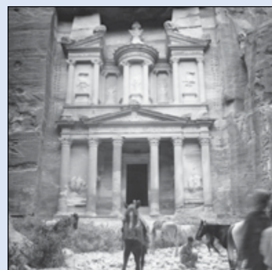
A Well-Preserved Ruin at Petra in Jordan