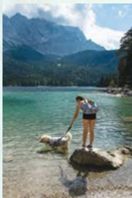
Barkley has a paddle in Lake Eibsee

As promised, the next day we made use of the free buses - leaving the kayak and oars back at base camp - and went to relax by Lake Eibsee. The sun was shining and there was a cooling mountain breeze. We had a lovely day on a beautiful lakeside beach surrounded by some fantastic scenery. Even Barkley had a paddle!!