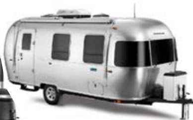
ALL NEW! 2020 Bambi Available for Immediate Delivery!