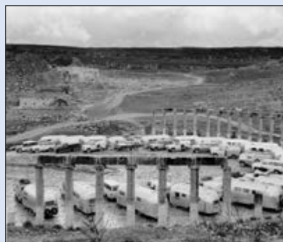
Parked in the Roman Forum in Jerash, Jordan