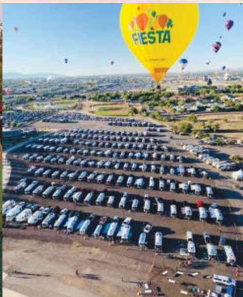
Balloon Fiesta Rally