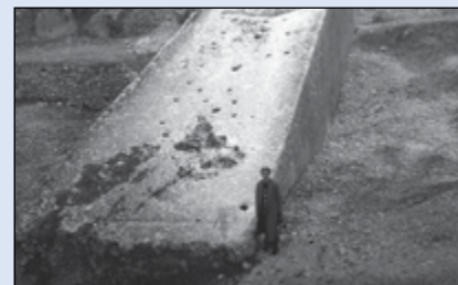
Grace Golden with the Big Stone at Baalbek