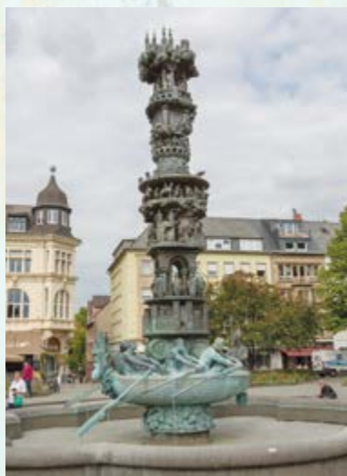
The history of Koblenz from the bottom to the top of a fountain

The fortress had lots of exhibitions including one on wine production in the area. After the fortress, it was a walking tour of Koblenz. The city is great to just wander around in. We found some really interesting and picturesque corners. My favourite, amongst many fountains, was one that was a history column depicting the history of Koblenz through the centuries from its founding to the explosions of WWII. Have a look at the picture - I think you will be equally impressed!