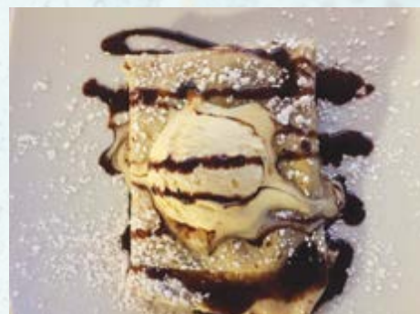
Pfannkuchen and Eis...yummy!

At the end of the day, we picked up the car and took a drive to Oberammergau. This town is famous for the Passion Play it stages every 10 years in thanks for it being spared the worst of the plague - the whole village prayed that the village would not lose anyone else and from that day, no one else caught it and those already suffering recovered. The play, and subsequently the town, attracts thousands of visitors from all over the world. It's a lovely town but we were quite late arriving, so we had a look around and then had dinner and ice cream...and because we are on holiday, we also had a crepe. Well, why not!!