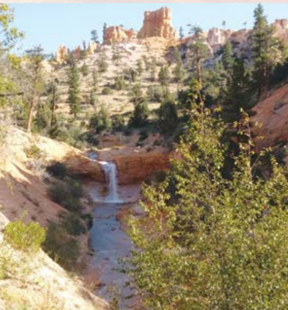
Mossy Cave Trail in Bryce Canyon

On the way to Page, AZ, we stopped at the Navajo Bridge visitor center to see the California condors. It was a great stop. A BBQ dinner was provided on arrival day at the campground. A version of the newlywed game was played by the four couples that had an anniversary date near. There was supposed to be a boat trip on Lake Powell the following morning. It was to be about three hours up to the Rainbow Bridge National Monument. It had to be rescheduled as the boat was taking on water. A song kept coming to mind. We took the time to tour the Glen Canyon Dam. There was a floating raft trip below the dam on the Colorado River. A few adventurous souls decided to take a swim. We were given a privately owned slot canyon tour that was out of this world. International President Mona Heath joined us at this point for