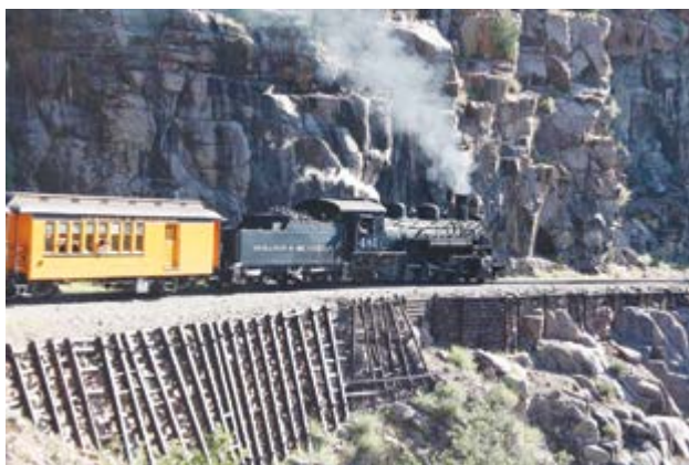
Durango & Silverton Narrow Gauge Railroad

Day 4 had us travel to the Santa Fe area. This stop included a trolley tour of Santa Fe with some time to shop and explore the old downtown. On the fifth day, we carpooled to the church of the "Holy Dirt" in Chimayo and lunched at Rancho de Chimayo. After lunch, there was a stop at Ortega Weaving. We received a lesson in hand weaving a rug. On our