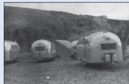
Camped in Front of the Big Stone at Baalbek, Lebanon