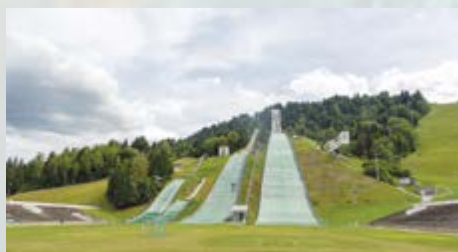
The Olympic Stadium Ski Jumps

After the gorge, we had to pass the Olympic Stadium which was built by Herr Hitler for the 1936 Winter Olympics and it held 100,000 spectators. It was the world's first steel ski jump and dominates the hill side. I felt strange walking around an arena where Hitler had been and thought back to the carnage that Europe had experienced in the years following that Olympic Game.