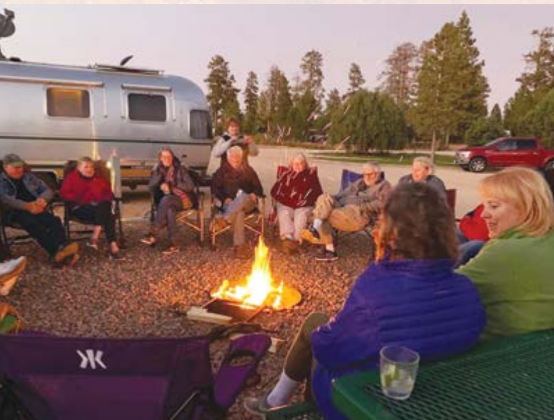
Campfire at Bryce Canyon

As we were told at the beginning, it was an adventure. A great adventure. We would do it again in a heartbeat. Can't wait for the next one.