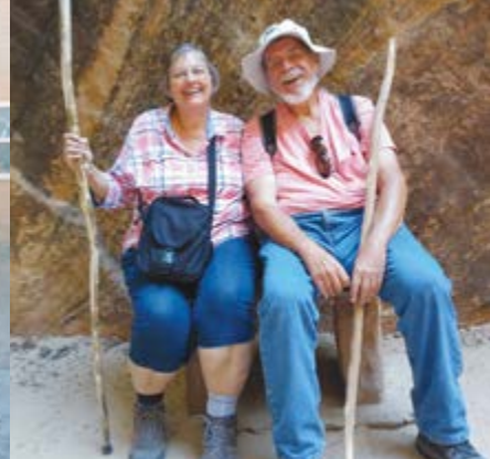
Resting at Zion National Park

98 degree heat. One day the owners of the campground took those interested on a slick rock jeep ride. We climbed up and down rocks at a 65 degree angle.