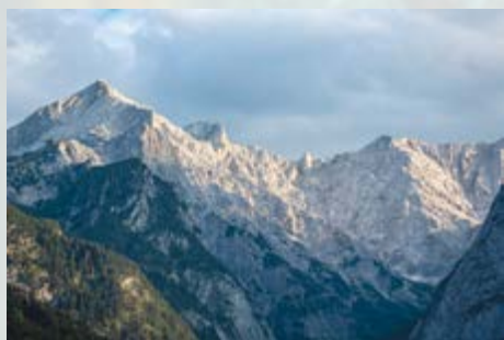
View from the campsite towards the Zugspitze

The area is dominated by the Zugspitze mountain which is in view from pretty much everywhere including the campsite. The campsite is very clean and efficient - bathrooms even on par with the ones in Switzerland!! The day was finished off with a BBQ. What's not to like...ice cream, followed by a BBQ back at Ali our Airstream. Another good day on the Lewis tour of Europe.