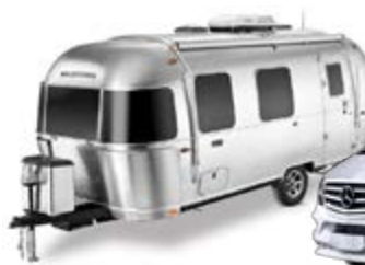
ALL NEW! 2020 Caravel Available for Immediate Delivery!