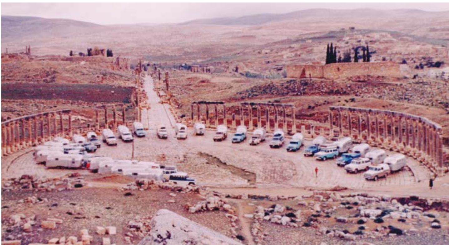
Parked in the Roman Forum in Jerash, Jordan in Living Color

On March 17, they left for Jerusalem, only a 2-hour drive away. They found the whole city filled with soldiers. They took a bus tour to the Garden of Gethsemane and several other biblical sites in the afternoon. The following day was a bus tour to the Church of the Holy Sepulcher and the Damascus Gate. The next day included visits to the Dome of the Rock, the Al Aqsa Mosque and a drive to Samaria and Jacob's Well. March 20 was a bus tour to Bethlehem and Hebron, during which they saw the tombs of several biblical prophets.