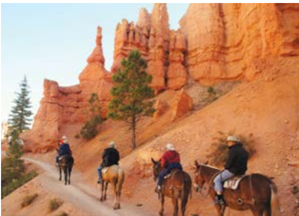
Bryce Canyon, Southwest Adventure Caravan