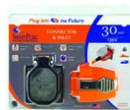
30 Amp Inlet and Connector Kit

Airstream Factory Service Center 419 West Pike Street Jackson Center, OH 45334 (937)-596-5111 ext. 7403