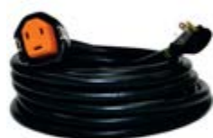
30 Amp RV Cordset