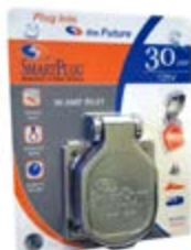
30 Amp Inlet

Airstream Factory Service Center 419 West Pike Street Jackson Center, OH 45334 (937)-596-5111 ext. 7403