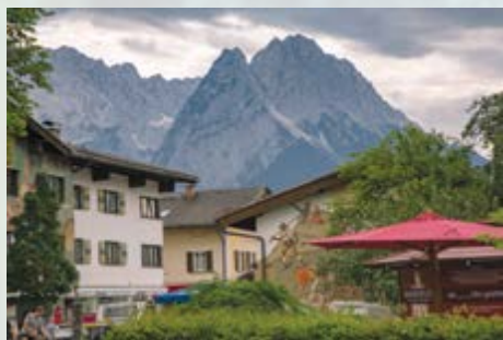
The Mountains around Garmisch-Partenkirchen

The area is dominated by the Zugspitze mountain which is in view from pretty much everywhere including the campsite. The campsite is very clean and efficient - bathrooms even on par with the ones in Switzerland!! The day was finished off with a BBQ. What's not to like...ice cream, followed by a BBQ back at Ali our Airstream. Another good day on the Lewis tour of Europe.