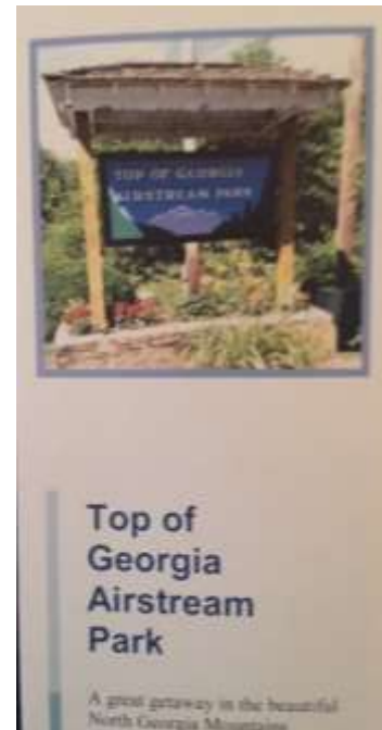
TOG Promotional Brochure