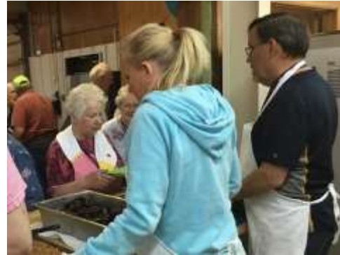
Serving in the kitchen