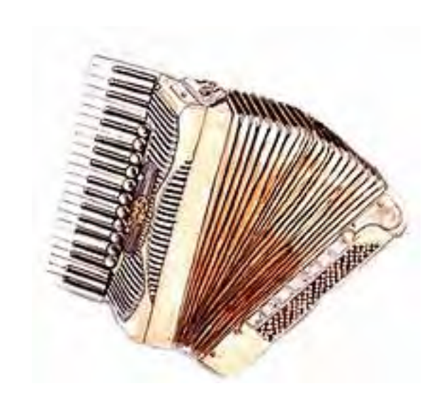
HARRINGTON ARTS CENTER