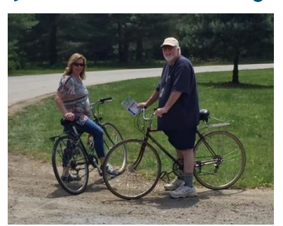
Lum's Pond Rally 2019