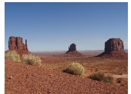
The Mittens at Monument Valley