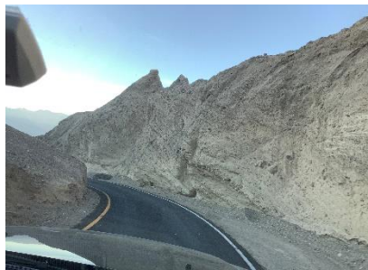
Artist Drive at Death Valley Nat'l Park