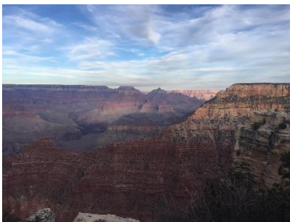
Grand Canyon Nat'l Park