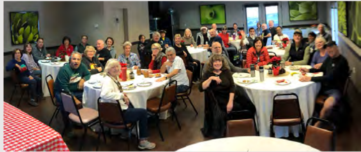
2019 Business Meeting

Whoever said “you should not mix business with pleasure” has never been to a GLAAC annual business meeting/holiday party. It is our belief that ensuring pleasure is the very reason for taking care of the necessary business of running our club.