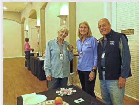
The morning food crew

In January- midwinter- it convenes to do all the preparatory work, such as submitting and tweaking motions and hearing reports from standing committees, that makes the summer meeting possible.