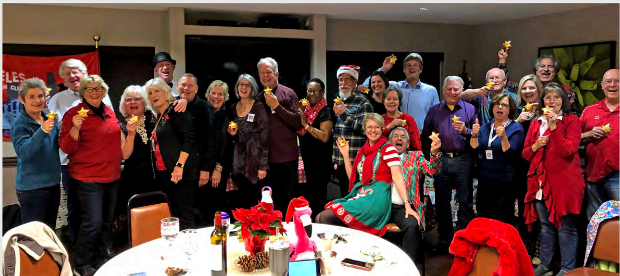
First Annual GLAAC Academy Awards

It was a wonderful culmination to another great year of GLAAC fun, friendship and adventure.