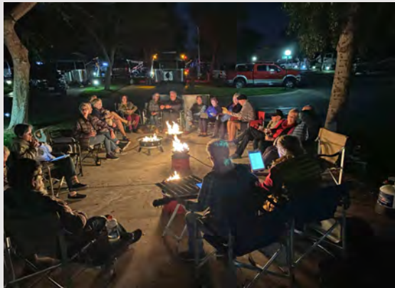
Caroling under the stars

The weather in the desert was beautiful and we even had our own “Airstream Avenue” in the RV Resort. As customary, informal campfire gatherings were the norm after dinner—bring your own beverage and a chair, sit down and chat. No invitation necessary.