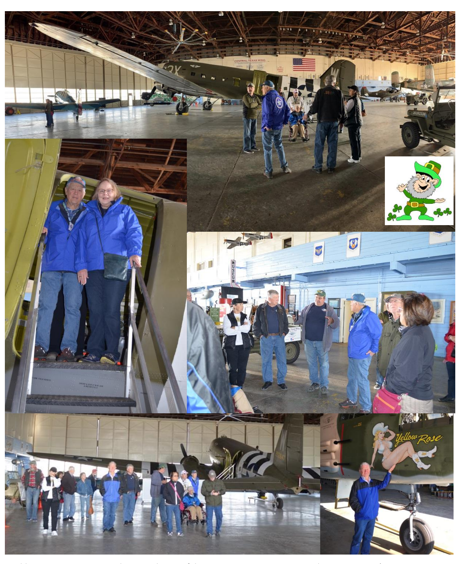
Hidden gem in San Marcos. The Central Wing of the Commemorative Air Force with Museum. Don't forget to visit if you are in this area. Museum hosts were very knowledgeable and friendly.