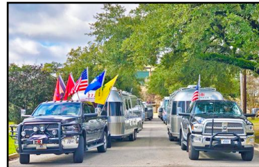
The third staging point after the town parade allows our rigs to be individually escorted by golf cart to their final pre-planned location in the Historic District.

Even though Henry had organized this event the previous year, I was still very impressed with the meticulous military style planning that goes into marshaling and staging 40 airstreams, starting with the Thursday night dry camping assembly at the marina. The following morning, fortunately bright and sunny, we inserted ourselves into a very specific pre-assigned