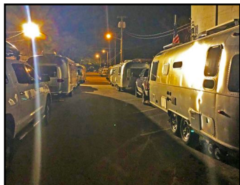
Night time in the Historic District on Orange Street. Temperatures dropped to the low 40's and a few generators were brought into action.

It goes without saying that the downtown rally takes a huge amount of organization, and my hat goes off