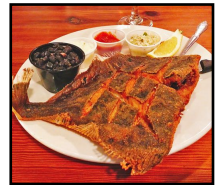
The signature dish of the Big Tuna restaurant - the deep fried entire flounder!

The SCCAC club members welcomed us in their midst and we shared meals and drinks with friends we had met on previous Alaska and Cajun caravans. New friends and acquaintances extended our greater Airstream family. We checked out as many restaurants as we could including River Room, Big Tuna and Graham's Landing. We stocked up on treats and gifts at the Indigo Bakery and chatted with the team who put together custom Airstream cookies that went into our official Georgetown welcome bag.