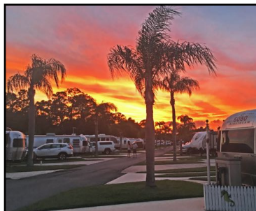
Sunset at Land Yacht Harbor, Melbourne, FL. We hated to leave this locale but common sense dictated that it would be better to weather the impending storm at home.