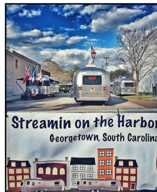
Safely parked on Orange Street, Georgetown SC, featuring the rally banner. This street was closed down which allowed for three parallel rows of Airstreams.

Airstream sequence (red numbers very important!) and were marshaled along the lengthy East Bay Park road where the convoy halted to install our flags before our 9:30 am ceremonial cruise down Highmarket Street with its canopy of live oaks into