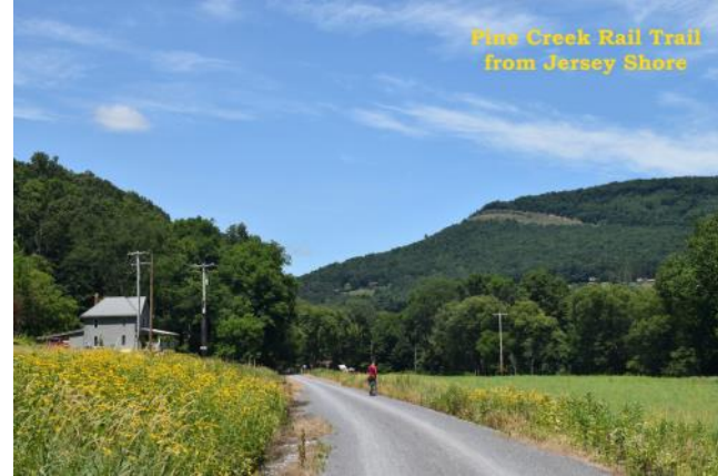
Pine Creek Rail Trail from Jersey Shore

On another day we drove to the Darling Run access point and rode south through the Grand Canyon of PA to Tiadaghton. Along the way, we passed homes with interesting solutions to crossing the creek. One had a suspension footbridge from their home to the trail and the other had a 'cable car', a platform suspended from a cable and a rope to propel the passenger across the creek to their cabin. At Tiadaghton there is a beautifully laid out tent camping area for those hikers or bikers who carry gear for overnight. We had a pleasant, quiet lunch at one of those sites. After the ride, we drove along Colton Road on the west rim to canyon overlooks that provide a view of the trail from above. Note, if you drive to this area, it may be a good idea to download your maps in advance, as there was no cell service in the area, so we had to navigate our way back the old-fashioned way.