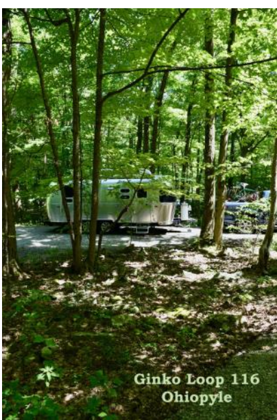
Ginkgo Loop 116 Ohiopyle

After 5 days, we moved on to Seven Mountains Wine Cellars, a Harvest Host east of State College. There was road construction along route 322 at the turn off onto the only partially paved Decker Valley Road to the winery. We parked the rig near the office to check in and then looped around their parking lot to their 4-sites located behind their home. These sites included 30-amp electricity which was a well appreciated bonus on a hot summer day and evening. This was a very private area since we were the only ones there. The parking area was a little sloped but we were able to level the trailer. After parking, Bert enjoyed wine and a cheese platter by our trailer.