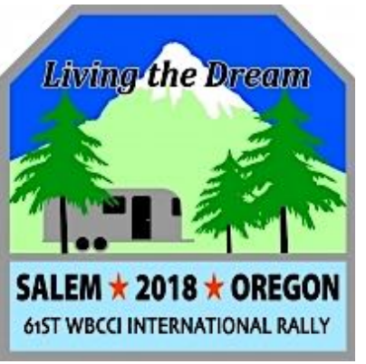
GOING? Sign up here.