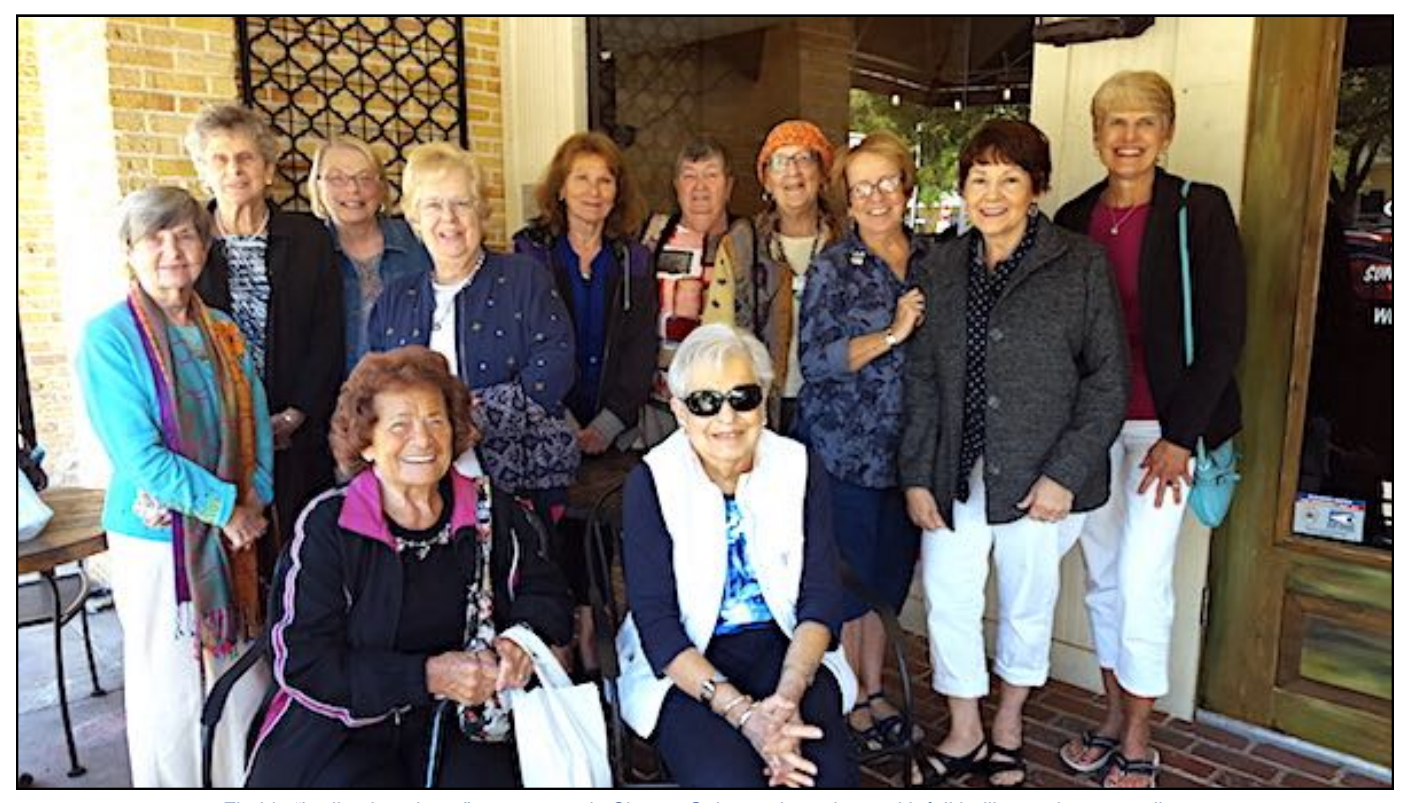
Florida "Ladies Luncheon" group, mostly Charter Oak members, here with full bellies and warm smiles.