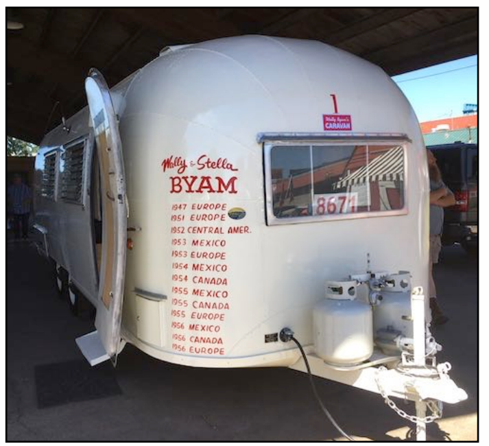
WBCCI #1 Wally's 1955 European Caravan White Trailer