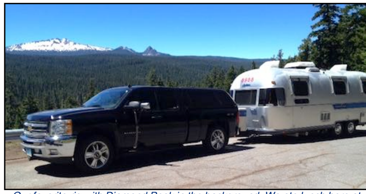
Our favorite rig with Diamond Peak in the background. We ate lunch here at 5000 feet!

The Region 1 Rally is in a week or so, August 9-12. Per Cod, Me - Charter Oak Connecticut, Bonnie Hogan- New England, Rock