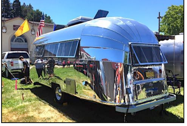
13 Panel back 1956 Flying Cloud