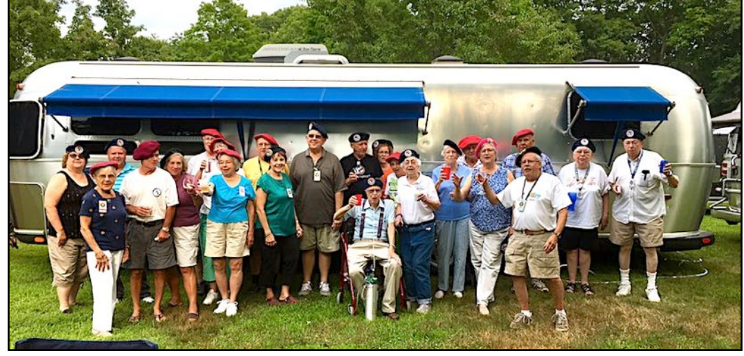
Bard prepping for our celebration of Bastille Day - berets for all.