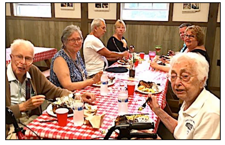
Barbecue chicken dinner ...mmmmmmm Good!!