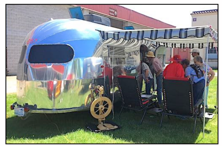
Much interest in restored Curtis Wright trailer.