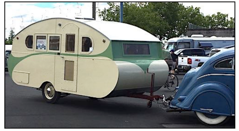
The oldest known factory built Airstream: 1936 Silver Cloud made of Masonite.