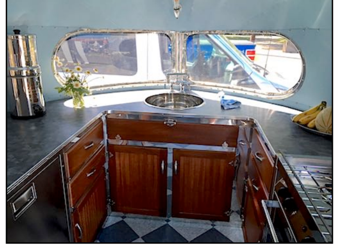
Impeccable restorations of late 1940 Curtis Wright trailer.