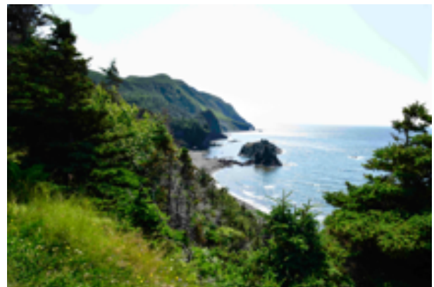
Green Gardens Trail, Gros Morne National Park

Moving up the west coast to the tip, we explored L'Anse aux Meadows, where it rained almost every day, and it was colder than other areas we visited. Back down and across the top of the big island, we explored each peninsula, Twillingate, Terra Nova and Bonavista. We took a ferry and spent a day on beautiful Change Island and another day on Fogo Island, but it could have been more.