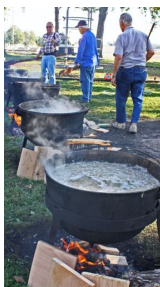
A special meal being prepared.

I have now been informed by the 2 nd VP of Region 4 that the popular Airstream rally will again be held in 2020 for the 58 th year, and that it will run from September 26 until October 4. Caravans of five or more Airstreams may park on Friday, September 25, at no additional cost. Rally costs and details should be made available in early February, with registrations usually being required by May. Meanwhile, those interested can find similar information from the 2019 event on the Swiss Festival National Rally web site.