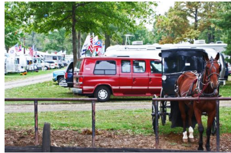
Sugar Creek is located in the heart of Ohio Amish country and local residents visit the camp regularly.

we-go rally and caravan. Participants will be making their own registrations once the schedule is published. Our goal is to arrive and park together after enjoying the trip there.