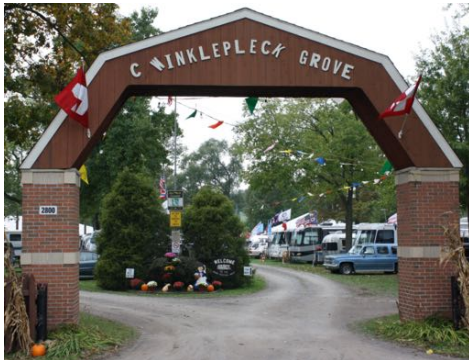
“Home Sweet Home” during the Swiss Festival in Sugar Creek, OH.

During the first weekend in October this year, the town of Sugarcreek, Ohio, will again host its annual Swiss Festival. During the week that ends with that Friday and Saturday