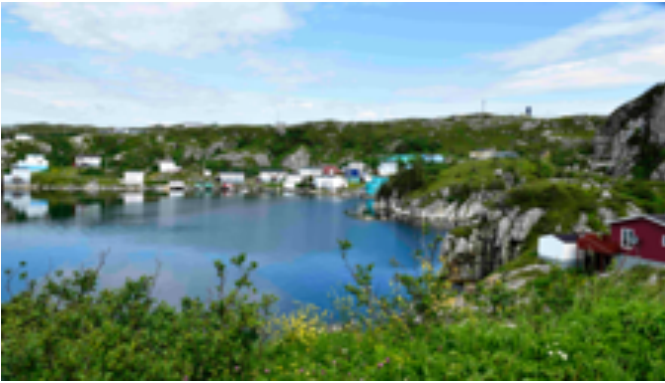
Rose Blanche, southwest side of Newfoundland