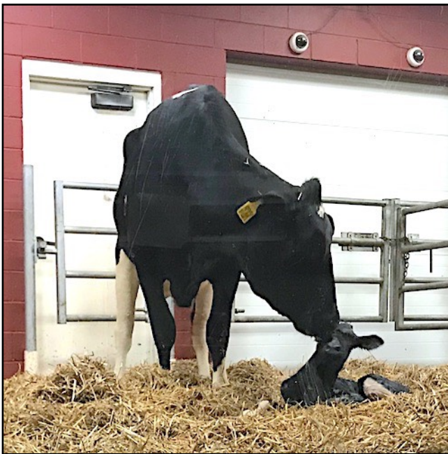
Welcome little one - a veal cute baby.

take a second turn around, however, they are no longer milked and, I think, get a stern reprimand. Thick glass and bus windows kept us well clear of any live animals, however, we were cautioned to never, never touch a cow. Touching could result in dreaded bovine contamination and possibly cause bossy to be shunned - so we herd.