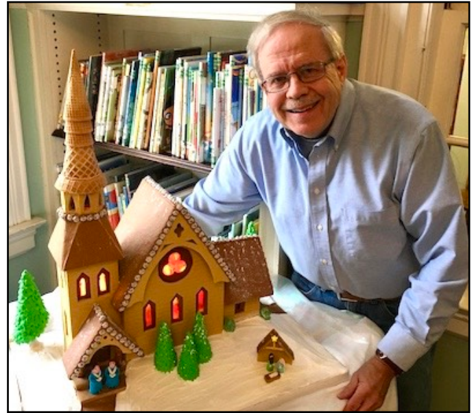
Beautiful job - a lot of work! Like pulling teeth??

Thank you to everyone who paid their dues on line as it makes my job easier. If you haven't paid, I will be contacting you. See you next year. ~