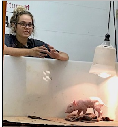
Peccary facts and a new baby named Francis.