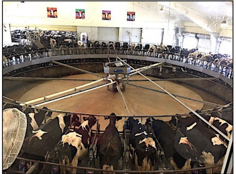
Bovine milking go round.

Definitely not the quaint old fashioned family farm, Fair Oaks Farm is a mega operation supplying milk and bacon to millions. The "Dairy Adventure" is well organized and hermetically sealed. Our group traveled a short distance to the milking station in an air conditioned bus which entered the milking barn just as the previous tour was leaving. We then proceeded to an air conditioned glass walled viewing platform to watch the cows rotate on the milking carousel. The cows enter and leave the carousel on their own and are fully milked during one rotation. Some cows enjoy the exciting ride and