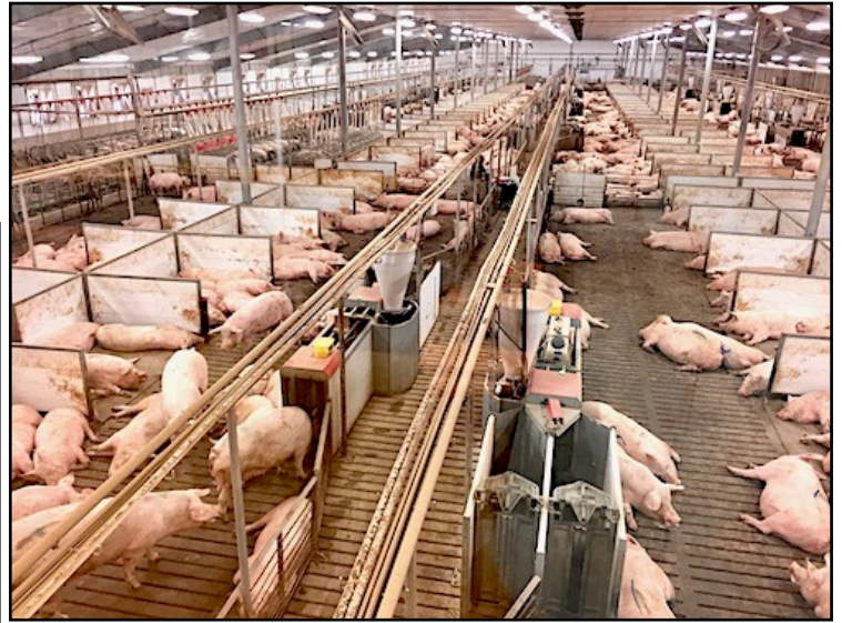
Oscar Mayer on the hoof.

Ike runs the country, and I turn the pork chops. ~ Mamie Eisenhower