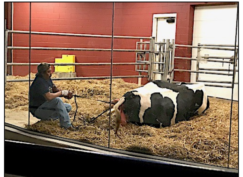
Sometimes mom needed help.

Next - "The Pig Adventure" - again behind thick glass you get to see and, thankfully, not smell (10,000 x 10) little piggies. Little cute baby piglets to roly-poly oinkers getting ready for their own tour of Cracker Barrel. I thought a nice touch to this adventure would be piping in the tantalizing aroma of sizzling bacon - ok why ham it up and introduce a stressful omen for these porkers.