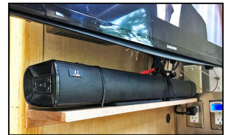
tweaks-p04c-sound-bar-6238.JPG Television Sound Bar (#90) improves the audio quality of our Samsung Airstream TV well beyond expectation.

the thermostat it maintains a comfortable mid-sixties when outside temperatures are in the 40's and 50's. Below that temperature we use a small space heater cube or if there is no shorepower we use a propane Gas Buddy or our furnace. We love the Amaze Panel because there is no fan noise, no on/off noisy cycling and perfect temperature control for a good night's sleep! Lastly in this category we installed a Television Sound Bar (#90) to improve the audio on the Samsung standard Airstream TV. The TV was relocated upwards a few inches to allow room to mount the 26" wide sound bar and a very convenient miniature digital audio cable made the connection. The