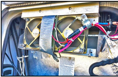
tweaks-p05a-fridge-fans-7967.jpg Fridge Fans Upgrade (#03) with two side by side low wattage, low noise and low cost computer cooling fans.

Our next category, Electrical and Energy Conservation, has the most scope for improvements. Fridge Fans Upgrade (#03) came fairly soon in our ownership. Within 6 months, we had experienced fan bearing failure causing noise and vibration that woke us up repetitively at night.