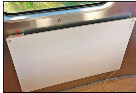
tweaks-p04b-Wall-Heater-7958.JPG Amaze Wall Panel Heater (#11) maintains our bedroom area at perfect temperature in most climates.

low-level warmth to the toilet area. Power consumption is rated at 80 watts so basically low consumption at less than 1 amp. This tweak has been adopted by so many of my Airstream fellow travelers generally as soon as their wives see the installation! Our second comfort tweak is the Amaze Wall Panel Heater (#11) mounted on the wall at the