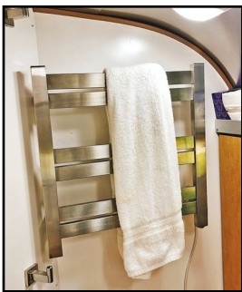
tweaks-p04a-towel-rail-7959.jpg Heated Bathroom Towel Rail (#01) is a source of pleasure after our shower in the morning.

In the Comfort & Convenience Improvements category, we have added three items that I rate highly. The Heated Bathroom Towel Rail (#01) was my very first Airstream modification replacing the regular towel rail with a stainless steel electrically heated towel rail powered by 110 volt when on shorepower. Never again would I step out of the