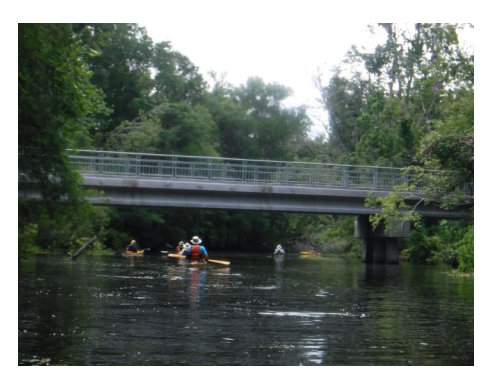
Deep Creek under Palatka-St. Aug. rails-to-trails bike path

The St. Johns County Fairgrounds are located about 5 miles west of St Augustine with easy access to the city (address is 5840 SR 207, Elkton, FL). The fairgrounds offer water and 30-amp electric at each site. (We will have a few 50-amp sites for those who may need it.) There is a dump station on site as well as showers and restrooms. We have arranged to have the club house, which offers lots of seating, air conditioning and restrooms, for