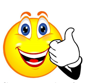
Share your tips here for safety, technology, or humorous lessons