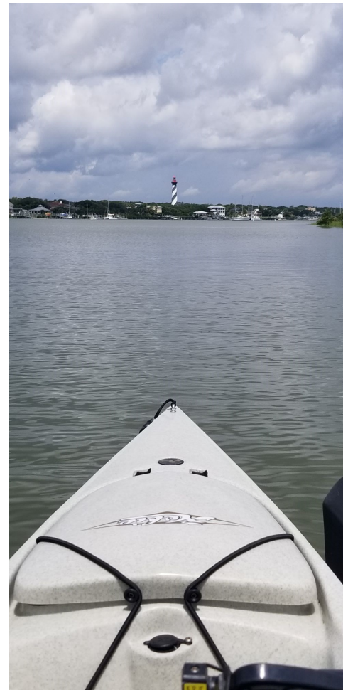
St. Augustine lighthouse from Salt Run, Anastasia Island, FL

When I'm old & gray I want more memories than wishes.