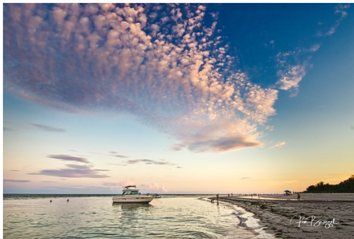
Periwinkle Park in Sanibel Island, northeast Florida