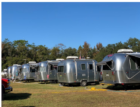
Fort Christmas Rally, 2019