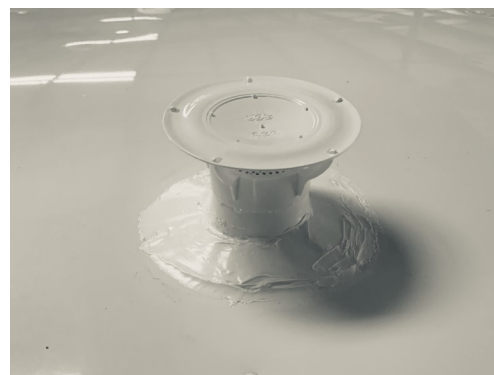
The Lippert 360 tank vent after installation.