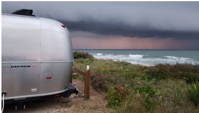
Gamble Rogers, Flagler Beach, FL