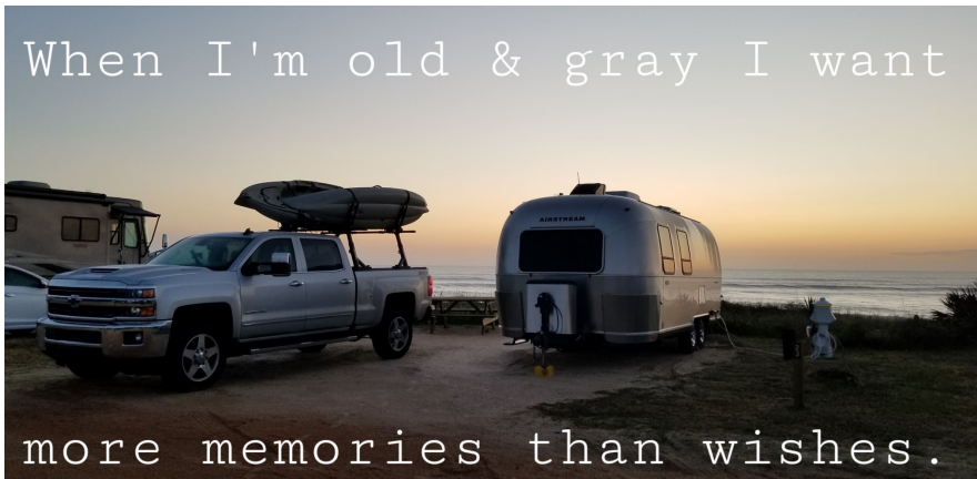
Gamble Rogers, Flagler Beach, FL

When I'm old & gray I want more memories than wishes.