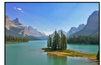
Spirit Island on Lake Maligne near Jasper - a classic iconic photo location.

Prince Edward Island, Canada, in the St Lawrence estuary is another of our favorite destinations with at least