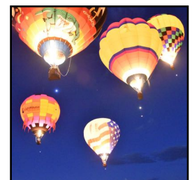
Albuquerque pre-dawn ascension of the first flight of balloons.

Among our spectacular activities, the Albuquerque Balloon Festival must rank near the top of life's rich experiences. The South West Caravan had arranged for the first two rows of Airstreams offering coveted center location, and it is truly without doubt spectacular. The joy of getting up before 5 am to witness the first group of balloons lifting off to