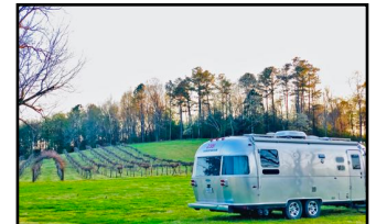
Peaceful night in a Mississippi winery thanks to Harvest Hosts.

In parallel with great food, we have put a few wine growing destinations in our trips specifically Paso Robles in California and the Kelowna Valley in British Columbia. There is a fine balance choosing down to earth wine destinations with ease of access and availability of campgrounds versus the Napa style overpriced and RV discouraged locations. Alternatively Harvest Hosts is a wonderful resource for experiencing unique one-on-one hosting and conversations with wine growers, especially the privilege of enjoying an evening in a vineyard after the winery has closed.