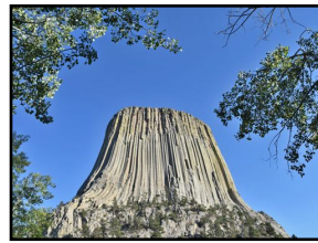
Devil's Tower, WY, scene of Close Encounters of the Third Kind.

Some US history is more poignant, such as the battle of Little Big Horn and the endless named soldier markers scattered across the rolling grassland hills of Montana. Little Big Horn was part of the group of historical sites we explored based around Custer, South Dakota. An unbelievable number of day trips are possible from this base including Mount Rushmore, Crazy Horse memorial,