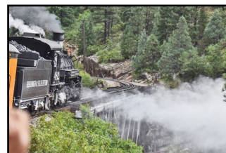
Durango and Silverton Railway lets off steam.

Canyon is accessible by cruise boat from Wahweap marina and navigates Lake Powell through the impossibly restrictive waterways of the red sandstone canyons. Colorado offers so much, but we were enchanted with Durango and the Silverton steam railway trip up the Animas River valley and the spectacular engineering built to access and service the silver mines. This ranks as one of the best rail and live steam experiences anywhere!