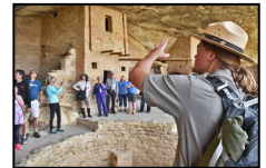
Mesa Verde NP Ranger leads our tour through the cliff dwellings.

Another Airstream destination with much more recent historic significance is Cape Canaveral, Florida, with history still being made today! Jetty Park is convenient for the Kennedy Space Center and frequent launches (thank you Elon Musk!) and has one of the best walking beaches along the coast. Further west, in Mesa Verde, Colorado, we immersed ourselves in an ancient civilization that flourished a thousand years ago (late 1100's) but mysteriously disappeared (by 1300's) as we scrambled through Long House, Balcony House, and Cliff Palace dwellings led by an NPS guide.