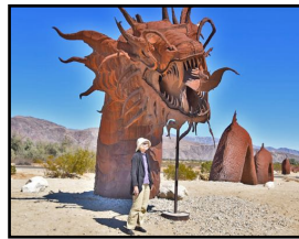
Metal sculptures are scattered across the Borrego desert.

immediate hiking and wilderness access straight out of the door. It's places like these that remind you of the foresight of the NPS preservation over many decades if not a century to keep this heritage intact for future generations.