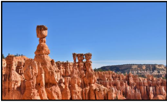
Thor's Hammer hoodoo at Bryce Canyon, UT.

What influences our choice of Airstream destinations? Do we even have to have a destination? There are so many