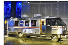
Kennedy Space Center and the Airstream crew transfer vehicle.