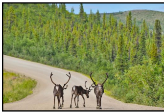
Top of the World Highway in Yukon with a herd of caribou.

Some destinations fall into the category of Edmund Hillary's famous quote "Because it's there!". Alaska is certainly as far as our wheels will take us and what a magnificent journey up the Alcan Highway, then up the Top of the World Highway through Yukon to the US border near Chicken Alaska. That's as far off the beaten path as you will get! On a side trip to Eagle, we discovered that the route north comes to a complete end - beyond that is only the Arctic tundra and wilderness! Memorable destinations along the Alaskan highways that we loved include Homer and Seldovia on the Kenai Peninsula, Valdez and the Columbia glacier on Prince William Sound.