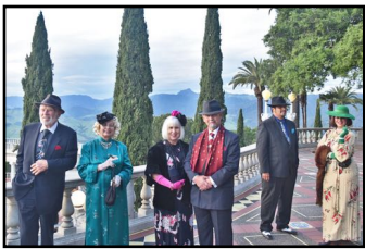
Reenactors at Hearst Castle made each stop a pageant of past grandiose life.

Our travels along the Californian Pacific coast included two heritage destinations - the Paul Getty villa at the Pacific Palisades and the Hearst Castle at San Simeon - both offer glimpses into another world of fine art and reproduction of lifestyles from another era. Our Living History tour (more $ of course!) of Hearst Castle featured docents in period dress and style to accentuate the feeling of a gilded age long ago! The Paul Getty villa recreates a Mediterranean atmosphere of the early Roman Empire in the theme of an elite Pompeiian coastal villa of the period along with the artifacts of the Greek civilization and earlier Etruscan culture.