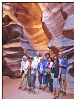
Upper Antelope Canyon with the South West Caravan group.

Traveling on the South West caravan introduced us to the Antelope Canyons around Page, Arizona. If you have an