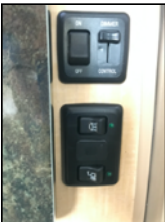
Lights are off.

Next up, I wired LED lights on the step and porch light switches and put labels on them. I could never remember which was the porch and which was the step switch, and I