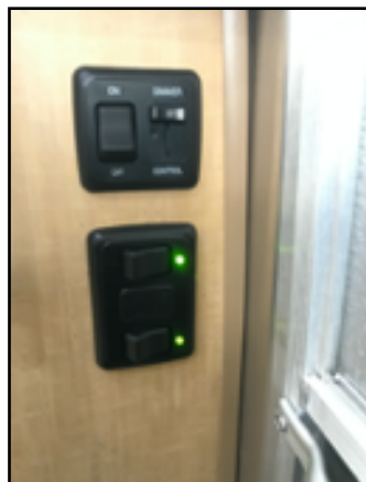
Lights are on.

was never sure if the light was on when I went to bed. Could be I'm getting old, but let's ignore that.