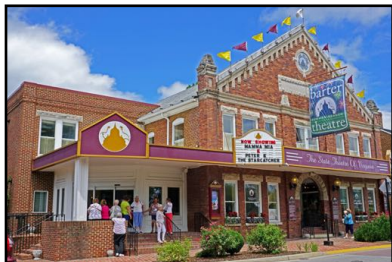
The Barter Theatre

We'd like to share some details and entice some volunteers to help during the event. The rigs will be parked in a couple parking lots off Rensburg Drive, which has the Farmer's Market shed and is one street off Main Street behind the restaurant area. Its