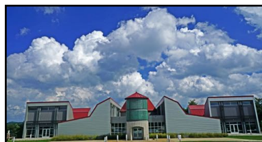
Southwest Virginia Cultural Center & Marketplace - Abingdon

We're thinking of charging a minimal amount for the breakfast and incidentals and making a second option of folks sending in money to an area charity with their reservation. The history of these events is to make a contribution to a local charity and to the economy by buying meals and services.