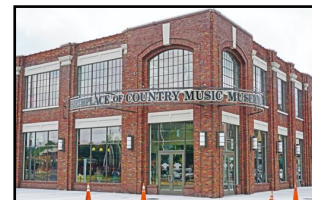
Birthplace of Country Music Museum - Bristol

Once there, the Farmer's Market folks are offering a breakfast, and we'll arrange transportation for those wanting to ride the Creeper Trail. Its a great time to ride it. Some folks may want to ride the entire 34 miles and others might opt for just the down hill to Damascus segment. We're hoping the Barter Theatre will be in Business and have a play available. We're also considering a history tour, but have not nailed that down yet.