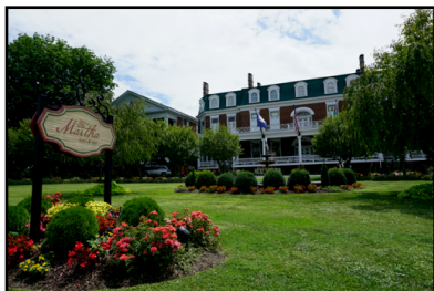
The Martha Washington Hotel & Spa

a short walk to the Barter Theatre and the Martha Washington Inn. There is a bike shop at the end of Rensburg with access to the Creeper Trail. As you know, we are near Bristol and the Speedway. There is trout fishing in the South Holston and actually a small stream at the other end of town. There is a muster ground with history related to the Revolutionary War. So, it seems