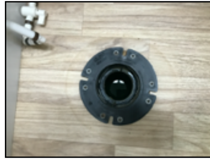
Looking down at the floor flange with the toilet removed.

a slight bit of water around the toilet base. After watching YouTube videos, I ordered some parts, removed the toilet, replaced the seal, hardware and the mixing valve. It proved a good time to clean the floor as well as the toilet. Then I put it back in place. Of these three projects, this was the easiest. In fact it might be worth doing once a year just to get the floor good and clean. While I was in