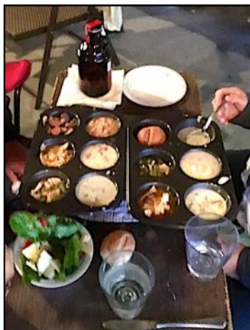
Less trips for tasting!