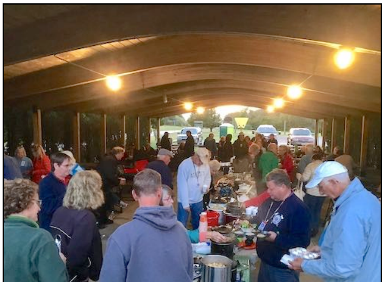
Airstreamers enjoying the mountain of food.