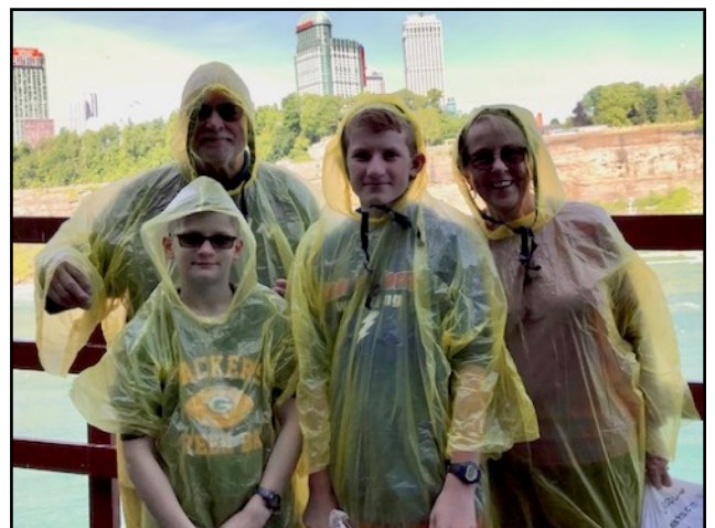
Dressed for Cave of the Winds.