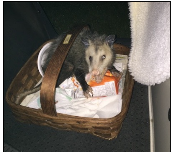
Possum enjoying goldfish - Priceless!

Don't forget to pay your 2019 dues! - Quote for November: To write with a broken pencil is pointless. ~