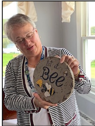
Written in stone.