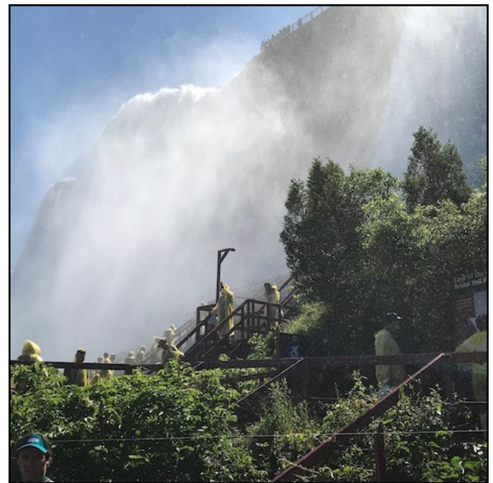
View from the boardwalk at Cave of the Winds.