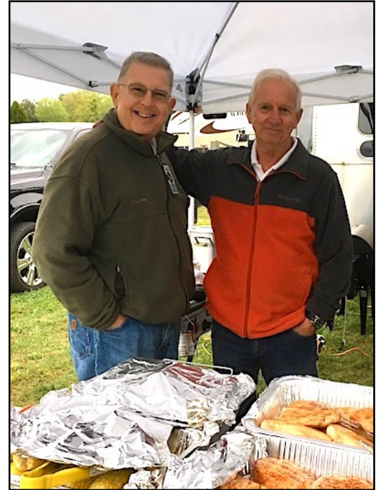
Proud head chiefs and bottle washers.