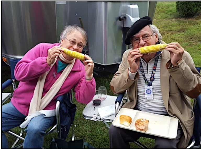
Any comment here would be much too corny...!