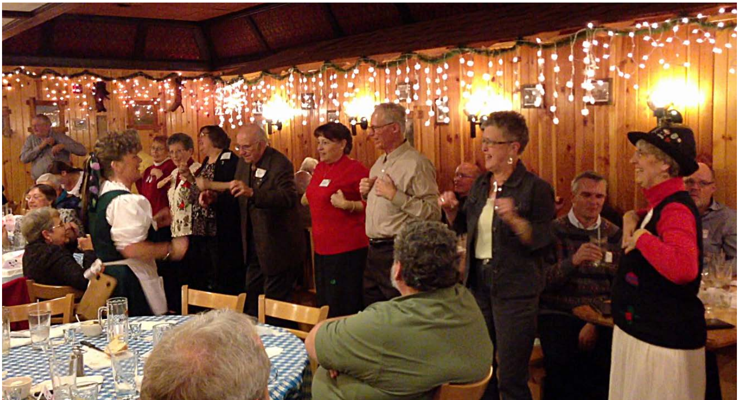
MN Unit Christmas Party & the Chicken Dance.