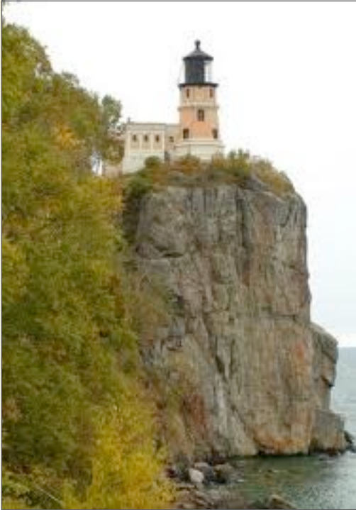
SPLIT ROCK LIGHTHOUSE