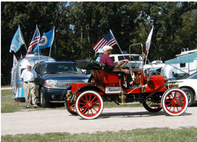
A 1912 Maxwell amongst the Airstreams.

trailers and talk with us. Afterwards we all went over to the American Legion (only about a mile away) for a buffet lunch. As you can imagine, cross-country touring in century old cars can be quite an adventure, and the owners had many great stories to tell.