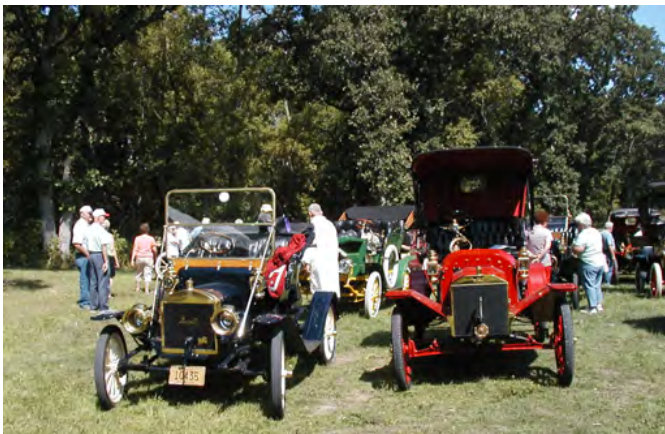
A gaggle of antique cars in our Happy Hour area!