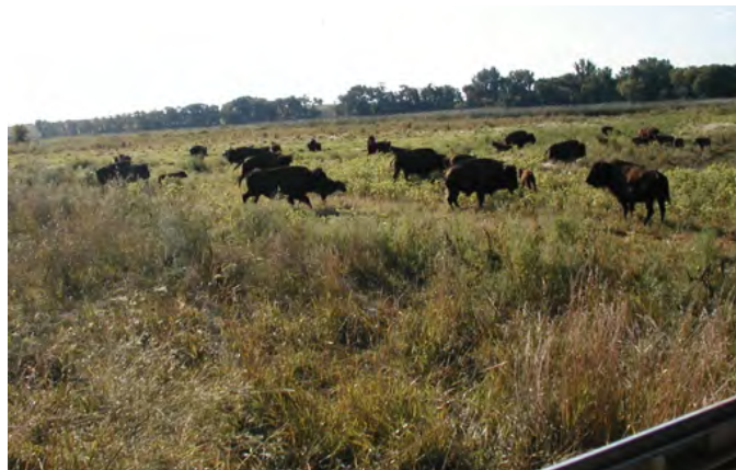
Buffalo herd as seen from tour bus window.

Thursday morning, members who arrived Wednesday went on the boat tour while the rest of us went on a tour of the J&R Bison Ranch, where the owner regaled us with stories of buffalo ranching. Bison are wild animals, not domesticated, and can't be herded like cattle. If they decide to go someplace, the best thing to do is get out of their way!