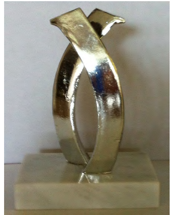
"Hands of Peace" Restoration and Replacement Project