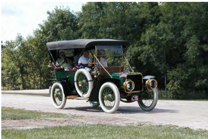
A 1907 Stevens-Duryea Six cruises into the campground.