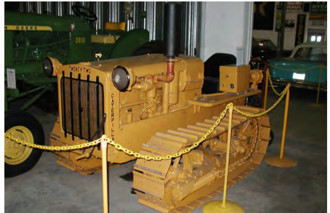
Early Caterpillar 22 at Schwanke's Tractor Museum

Friday was a grand tour of local attractions including such places as the Kandiyohi County Historical Museum and Schwanke's Tractor Museum, a huge collection of antique tractors and cars, including some one-of-a-kind models.