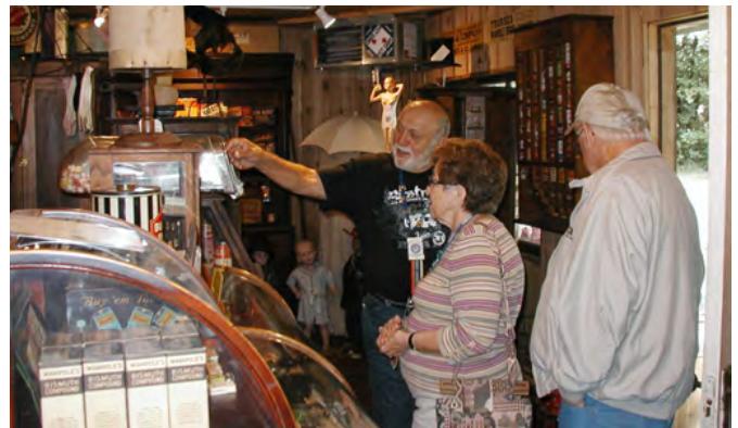
Nostalgia tripping at Sheehan's Country Store.

Friday's festivities were finished off with a trip to New London to watch the pre-run antique car parade. Those willing to get up early enough returned to New London on Saturday morning to watch the official start of the 120 mile run at 7 AM, followed by a pancake breakfast. Then we were off to tour two little-known private museums, Sheehan's Country Store and Levin's Raptor Ridge.