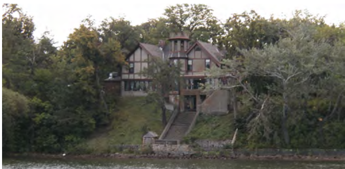
Spicer Castle on Green Lake