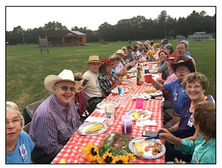
Table of friends...