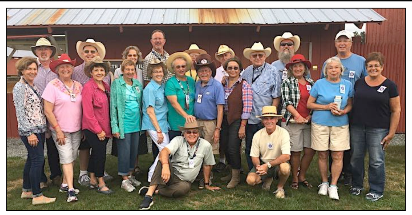
They sure look like friends, and well fed, and clearly having fun - must be a Region Rally!