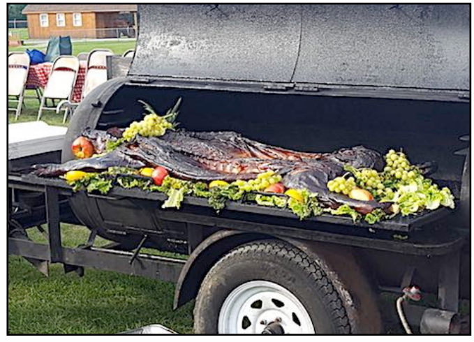
Close your eyes - you can smell it cooking!