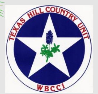
NEW website: https://airstreamclub.org/ TexasHillCountry