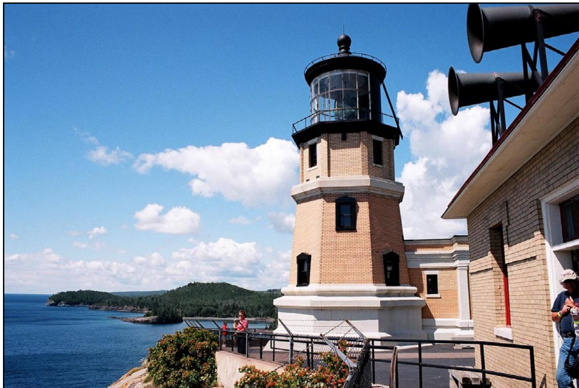
Split Rock Light House, On Hwy. 61, 20 miles northeast of Two Harbors, MN

Pet health documentation is required to enter Canada.