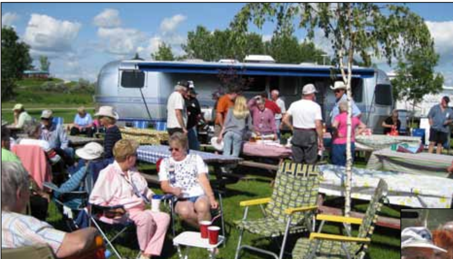
Region VII members enjoying happy hour on a beautiful, Winnipeg day.