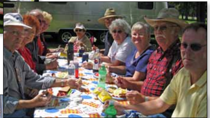
North Dakota caravan members take a break enroute to the Region VII rally.