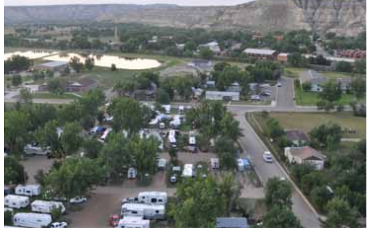
2010 Region 7 Medora rally at Red Trail Campground.->