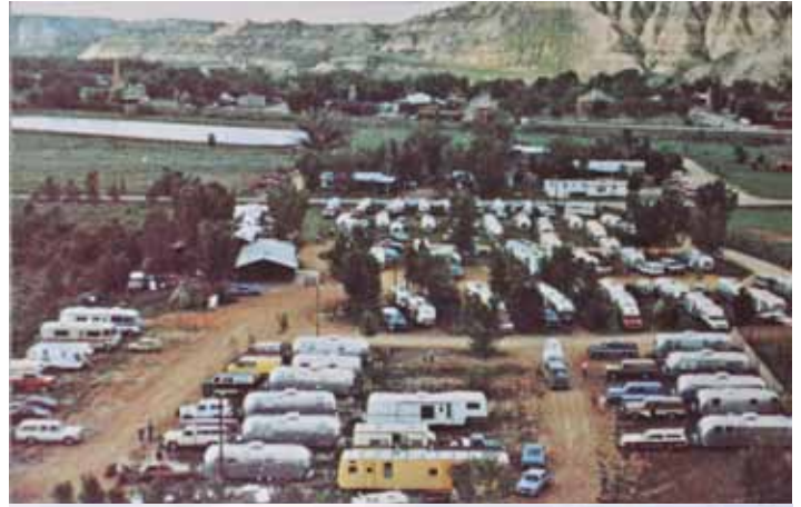
1981 WBCCI rally at Red Trail Campground. ->