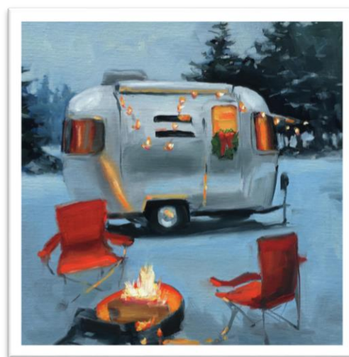
Christmas in the Snow

They'll air performances throughout the long weekend, Thursday to Saturday. Anything you don't watch in real time will be archived and available for a full week. You can watch everything as a family, or let everyone in the house pick and choose what they want to watch on their own time.