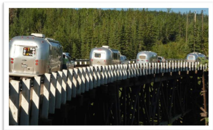
1942 Kiskatinaw Bridge on Alaskan Highway.