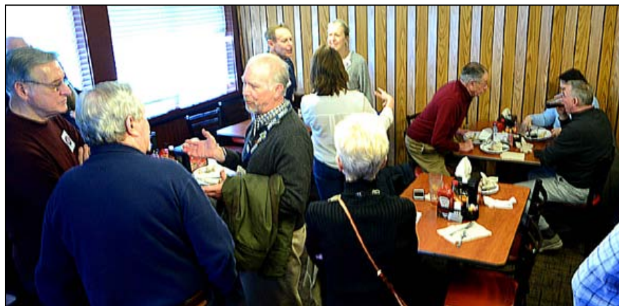
Photo below: Getting to know you! NORVA held a luncheon rally at the end of February to welcome its newest members.

We will update the rally schedule as things get back to normal and we can once again look forward to getting "hooked up." Stay safe.