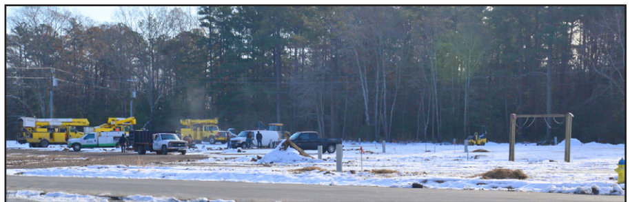
Above: The snow covered campground at Fort A.P. Hill is undergoing total renovation.

ership and merchants are onboard, enthusiastic, and have pledged full support of the event. The rally will feature a parade of Airstreams through town, followed by dry camping for three nights along N. Main Street in the business heart of Farmville. For those members so inclined, the event will include an "Open House," where the public can visit the trailers and see the interiors. The rally will also benefit a local charity in the town. More details and sign-up info will be forthcoming in future issues of NORVA News .