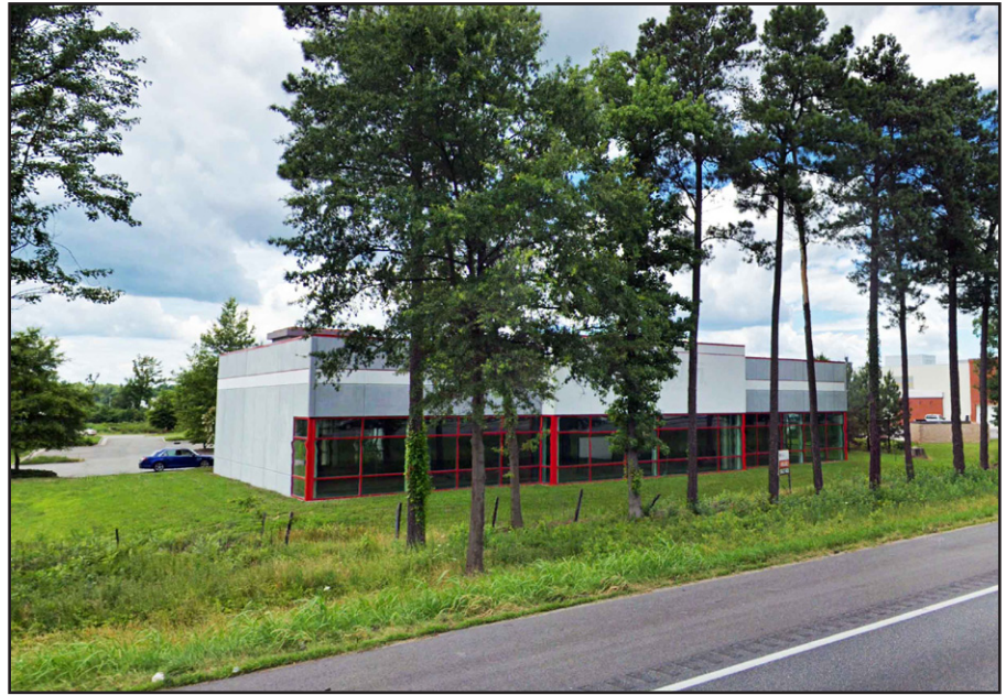
New showroom for Airstream of Virginia along I-95 near Ashland.