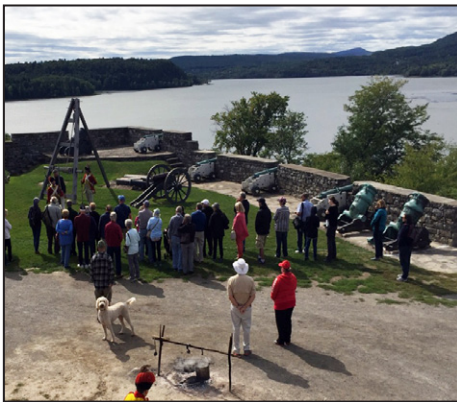
Left: The caravan stopped at Fort Ticonderoga on the Hudson River in New York.