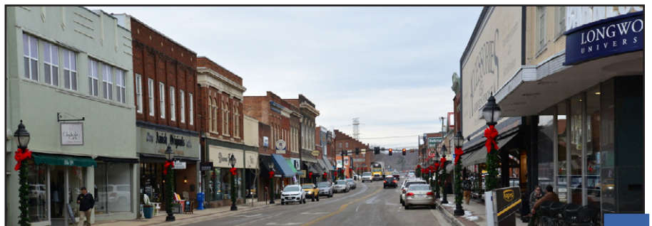
Below: Main Street, Farmville, which will host 20 dry-camped Airstreams in October.