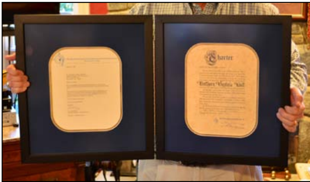
NORVA's original charter was issued in 1969. The Club celebrated its 50th Anniversary in 2019.