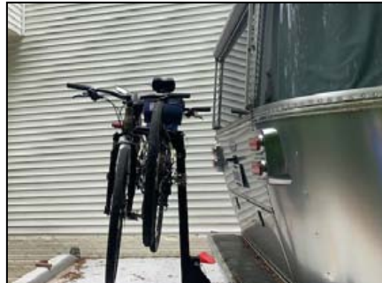
Above: Bikes on the rear of the Nagel Airstream use a Yakima hitch mount rack inserted into a custom-fabricated frame receiver.