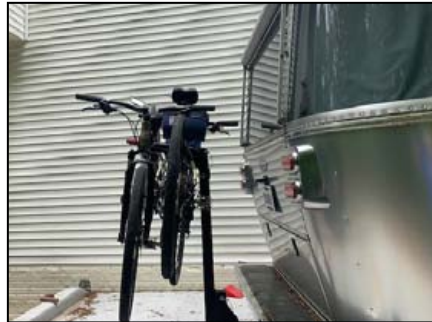
Above: Bikes on the rear of the Nagel Airstream use a Yakima hitch mount rack inserted into a custom-fabricated frame receiver.