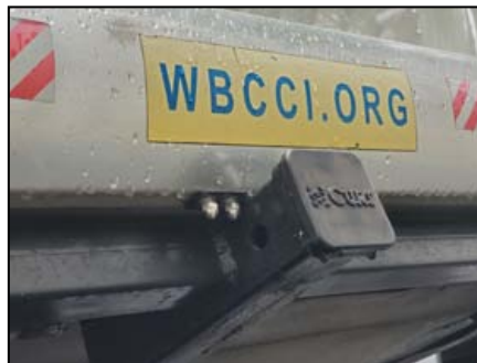
Below: Close-up view of the receiver frame assembly under and behind the bumper of the Brodsky trailer.