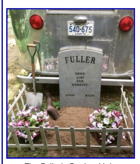
The Fuller's Gopher Hole

During the 1950's toilets were first offered in Airstream trailers as an option. The "International" series often denoted trailers that boasted deluxe trim and provided a self-contained camper complete with toilet and black water tank. Along with