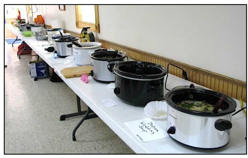
There were a lot of soups to sample. Just say you put away only one small cup of each soup, you would have consumed seven million calories, stood up and screamed "telephone" at the top of your lungs just before lapsing into a coma, and finally you would have exploded. I made that up - but there were a lot of wonderful and delicious soups.