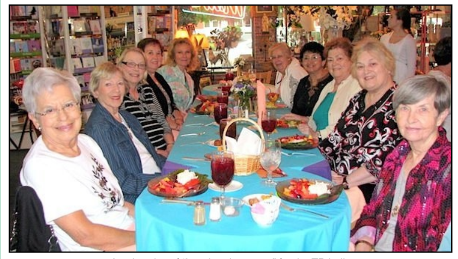
Another day of "Lunch at Lamoges" for the TR ladies.