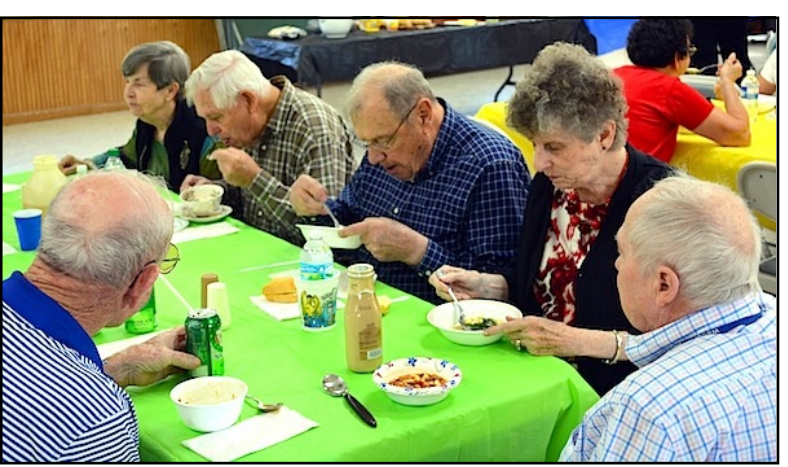
This is a picture of Soup Concentrate.