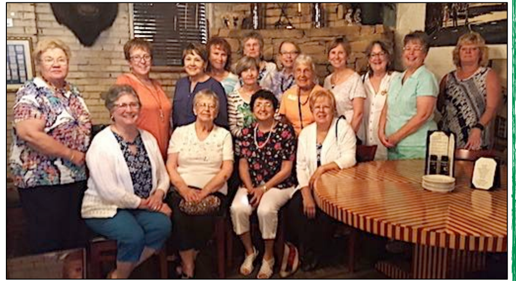
Many COCU ladies out to lunch in Dade City, FL.