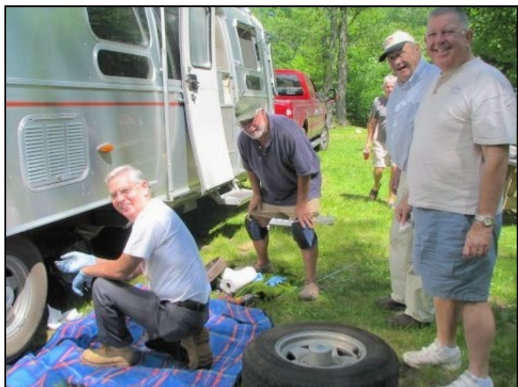
Smiling and checking...

It was a magnificent weekend thanks to the location, weather, and the camaraderie of our group. All this fun even though we had no hook ups! Some said it was just like the rallies of earlier, simpler times. ~