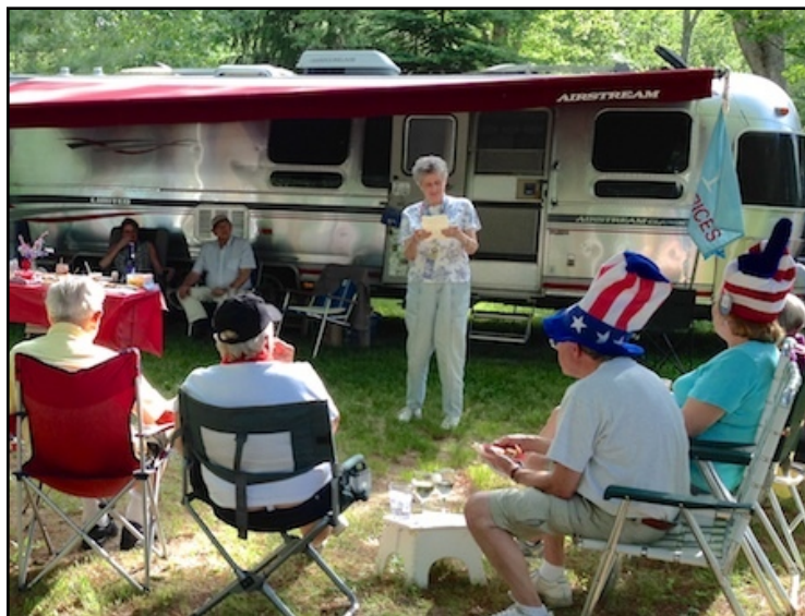
Just the right time - - - for another Lois rhyme...