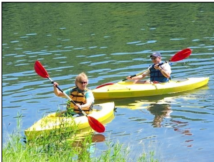
How the pros do it...