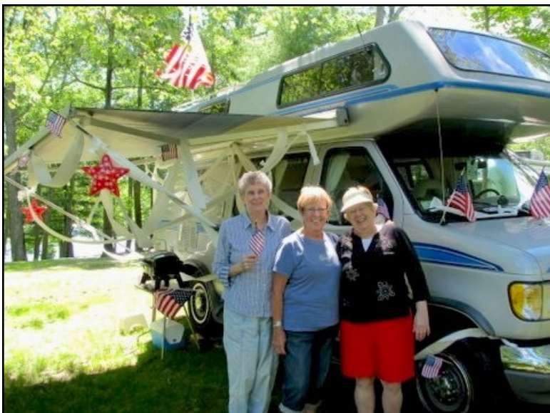
Smiling and posing...