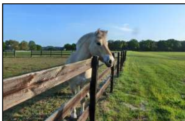
Beautiful Horses and Farm