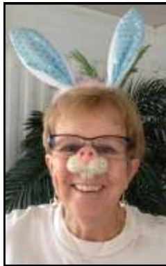
Happy Easter Time