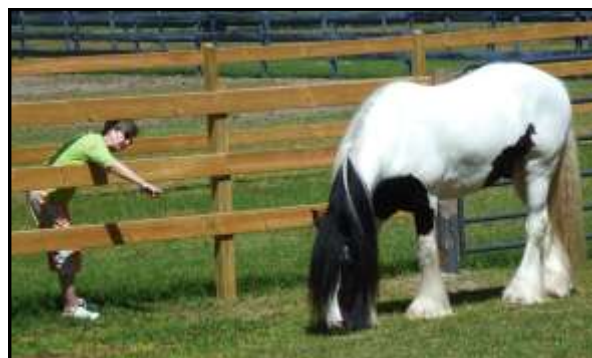
Shy Gypsy Vanner

It's gunna be good, it's gunna be fun, it's gunna be good for everyone.