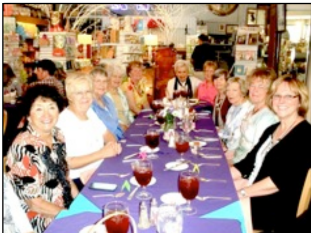
Travelers Rest annual ladies only Lunch on Limoges.