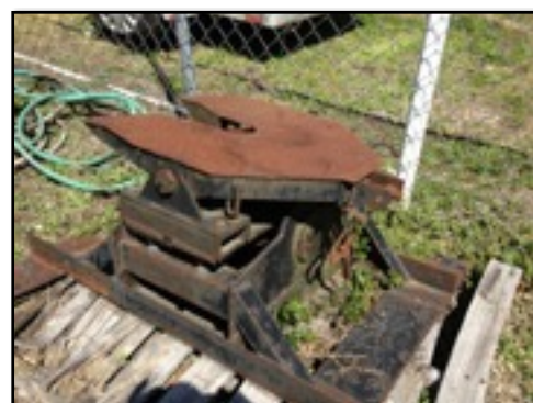
Reggie's heavy duty fifth wheel receiver sits at Travelers Rest unused and rusting away.