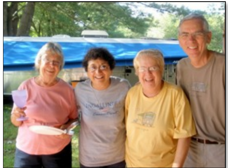
They really took good care of us!

Sunday morning brought a very satisfying continental breakfast with very good coffee. ~