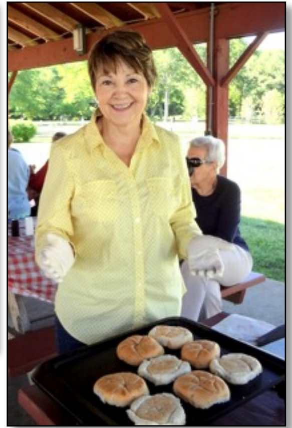
Good Food ... Good People ... Good Time June Rally 2013