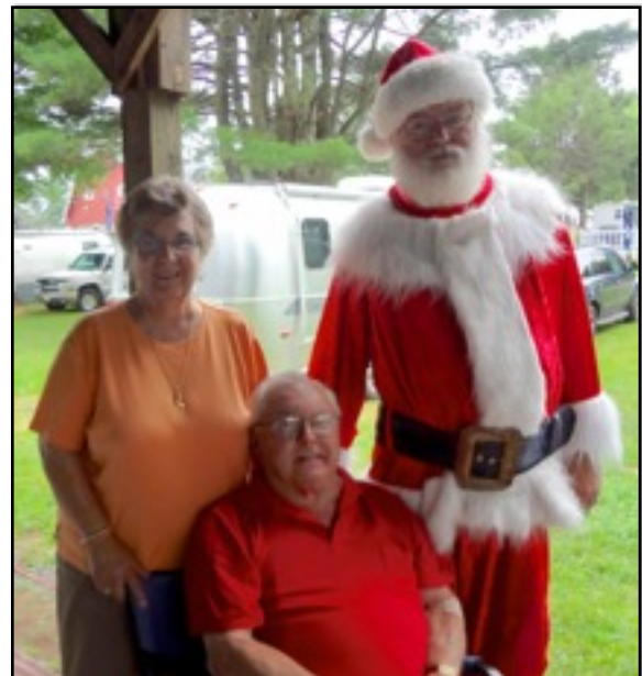
Yes Virginia, Santa was there.