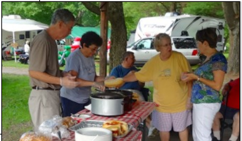
Getting those meatball grinders ready.