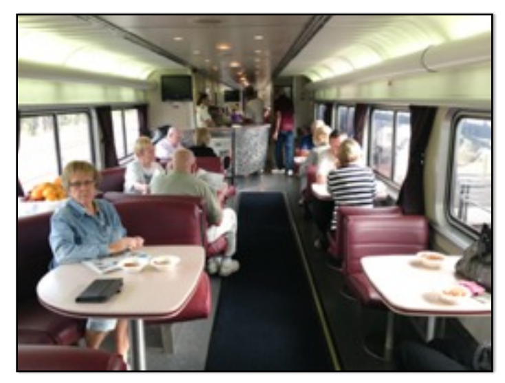
THE LOUNGE WAS A COMFORTABLE PLACE TO SPEND TIME.

Most of our time was spent in the comfortable lounge car reading. Our dinner time was 7:00 pm and they are very punctual. They fill every table so couples share a