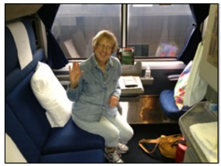
OUR SLEEPING QUARTERS.